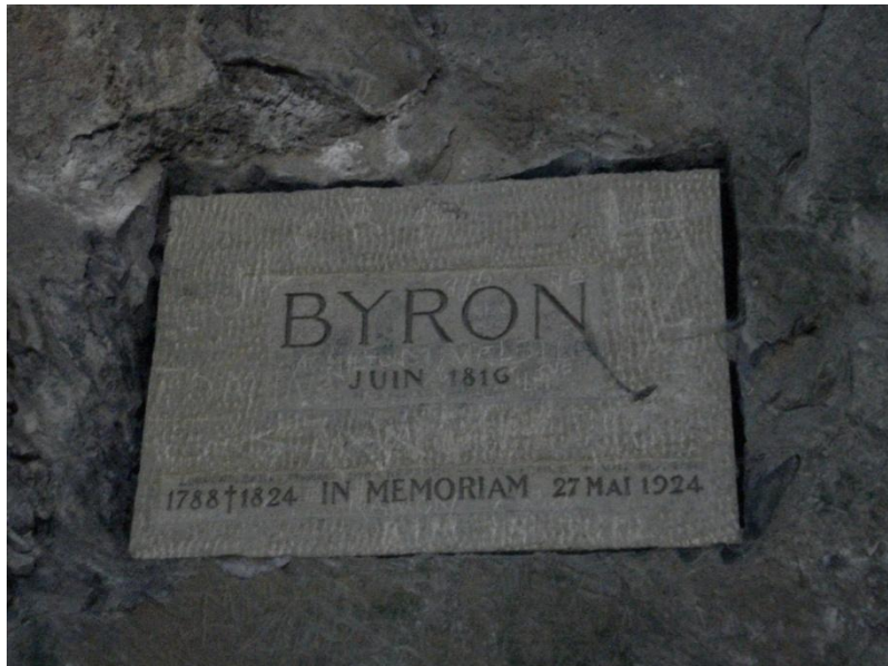
Plate Five: Byron was here...Chillon