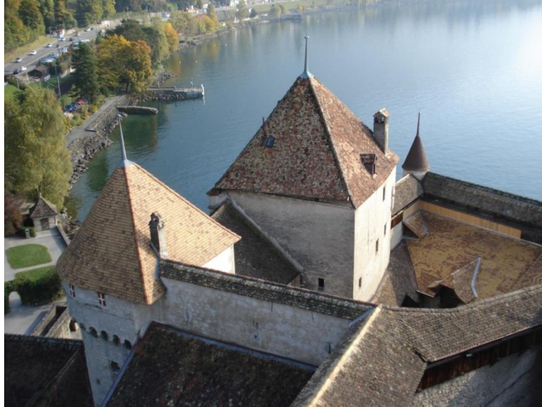
Plate Four: The view from the keep, Chillon, in October 2008