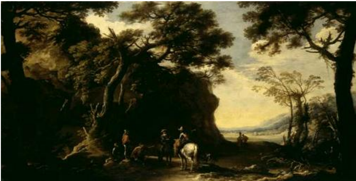
Plate One: Landscape with Travellers (1641) Salvator da Rosa (public domain)

I want to begin by considering Lear's Italian refuge. Lear's account of his reasons for travelling in and writing about Calabria draws attention to the significance of visual and the fact that 'Calabria's scenery, excepting that on the high road, or near it, has been rarely portrayed' (Lear, 1852, 30). He sees the landscape of Italy in terms of its utility for his purposes as a painter; at Galliciano for example he notes that the 'neighbourhood [ sic ] abounds with studies for the landscape painter' (Lear, 1852, 2) and in the impressive view from the Palazzo Marzano, Sicily floats on the horizon's edge, 'just where a painter would have put it' (Lear, 1852, 53). Picturesque tourism in Italy had been popular from the late eighteenth century, as British travellers inspired by the Italian landscape paintings of Claude, Gaspar Poussin and Salvator Rosa from the previous century sought out such scenes on the Continent.