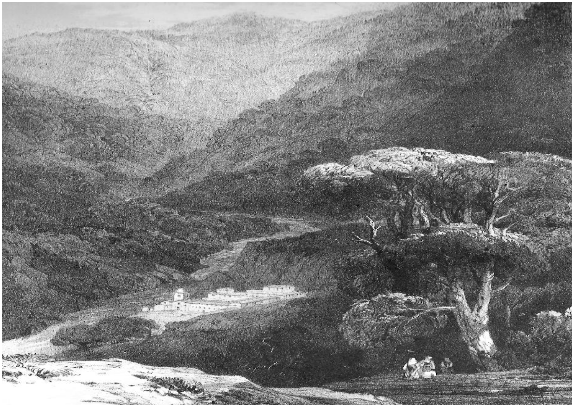
SANTA MARIA DI POLSI

The local people are polite, generous but not overly inquisitive in Lear's model of Italy. As he notes with approval, 'The peasantry of Cànalo were perfectly quiet and well-behaved, and in nowise persecuted us in our drawing excursions' (Lear, 1852,119). Therefore, according to Lear's ideal version of his travel in Italy, his status as 'landscape painter' prevails over other more intimate relationships with the people. He is able, in his picturesque refuge, to follow a prescribed itinerary without interruption and to produce painted versions of the places he visits.