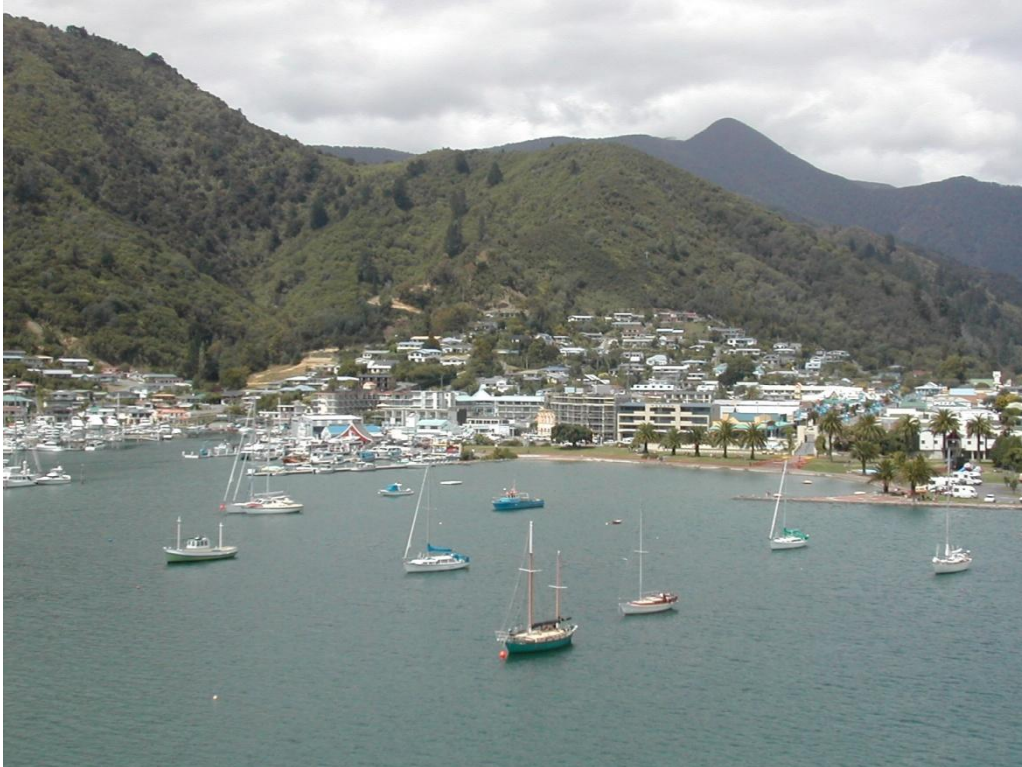
Plate 2: Town of Picton (South Island).