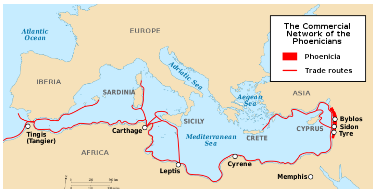
Figure 1: Phoenician trade routes