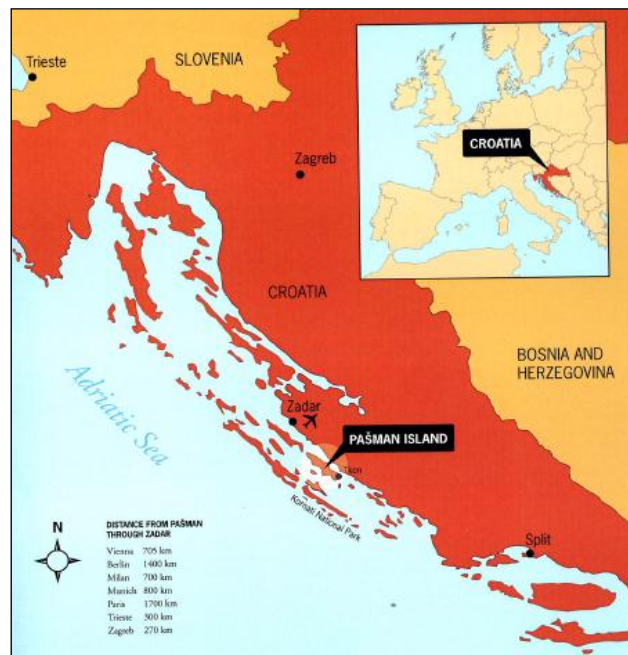
Figure 3. Map of destination site: Pašman Island, Croatia