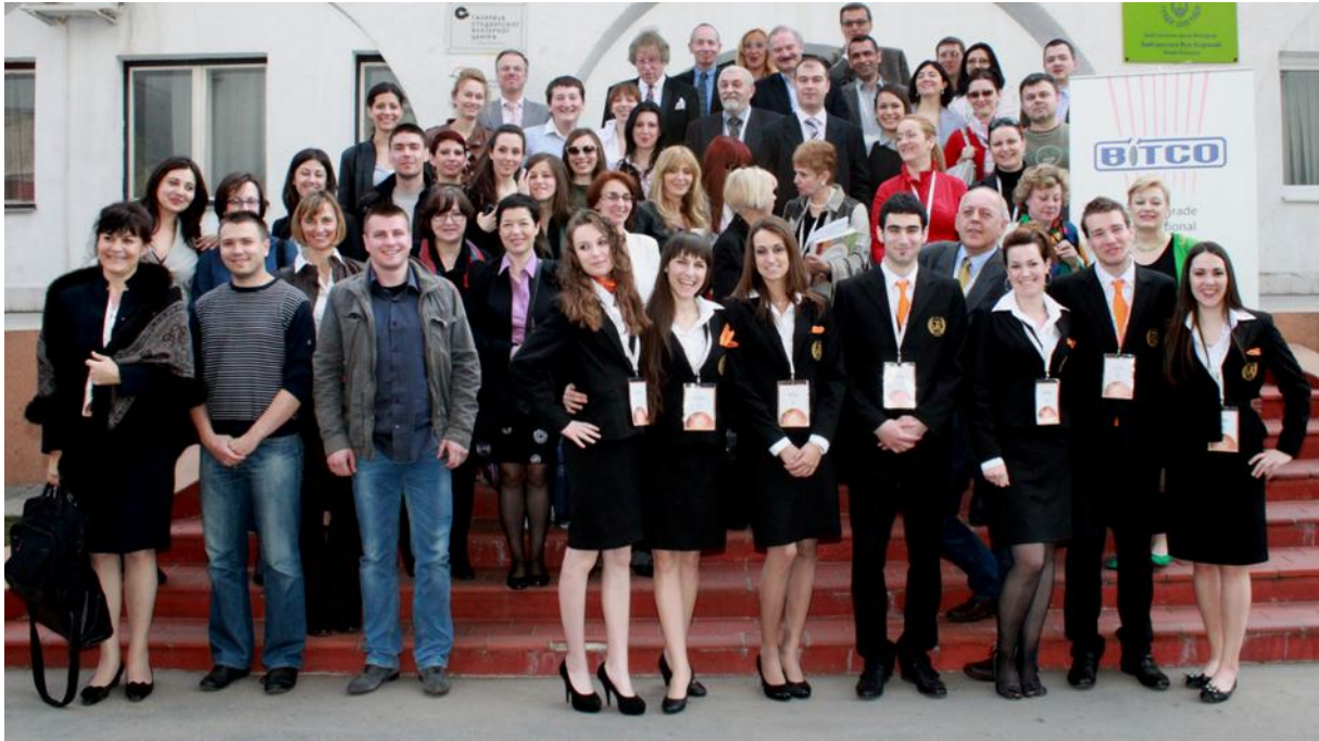
Figure 4: Many of the delegates and students at BITCO