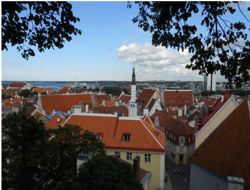
Figure 1: Old Town, Tallinn, from Toompea Hill. The university is in the middle distance.

Bravo to William Feighery for going ahead with this, the Second ETF conference, despite a disappointing number of registrations. Others loss, very much our gain. Indeed, with less than forty delegates, it is possible to secure real interaction with paper presenters – there was only one parallel session.