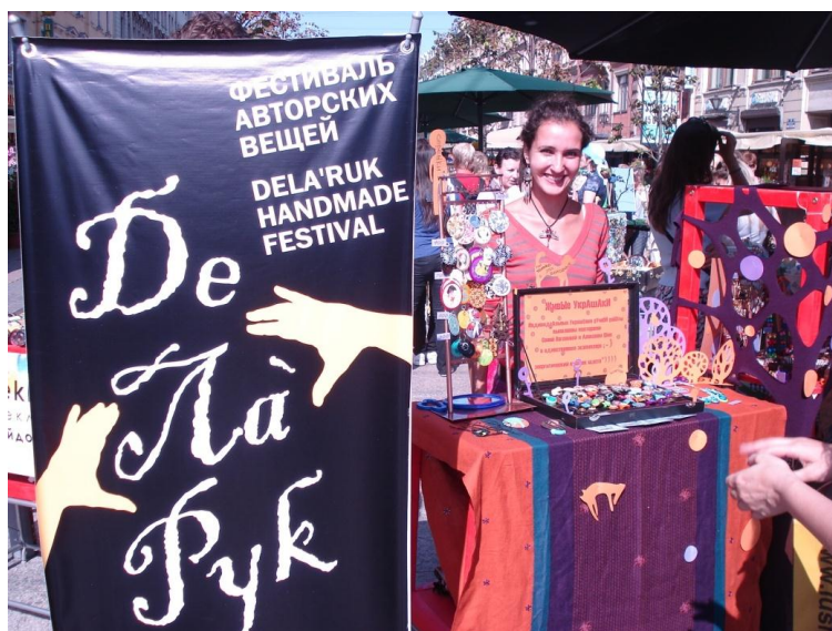
Figure 1. DeLa'Ruk Handmade Festival