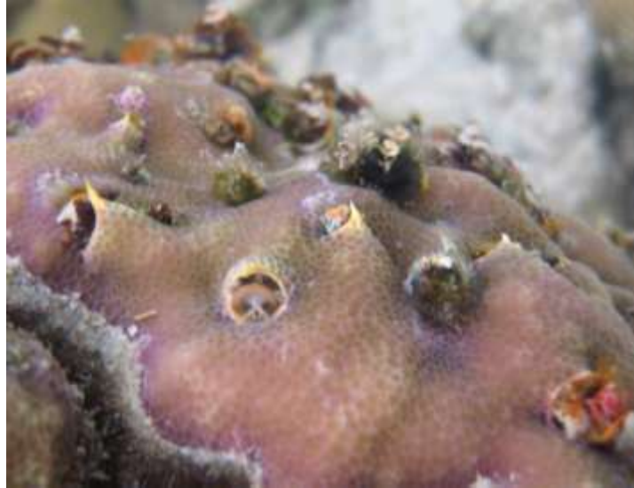
Figure 3: Clustering: Mutualism, commensalism or parasitism?.

2005), aggressiveness (Dai, 1990), corallite size (Dai & Yang, 1995) and conspecifics (Smith, 1984a). S. giganteus is uniquely adapted to tube-dwelling life possessing a specialized branchial crown and photoreceptors (Smith, 1991), spawning synchronicity (Beaver et al