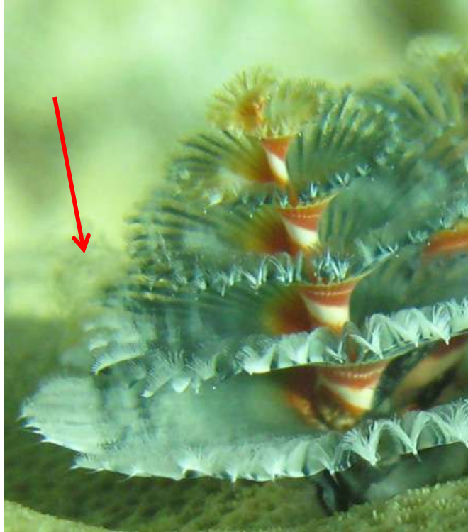
Figure 2: S. giganteus with coral mucus (arrowed) in tentacle whorls.

grazing by scaridae fish favoured colonies with high densities of associates. They further revealed that coral tissue associated with Spirobranchus giganteus had significantly higher nitrogen content compared to grazed and intact massive Porites colonies (Rotjan & Lewis, 2006). Yet Kicklighter and Hay (2006) demonstrated that due to retraction and conspicuous branchial colouration, predation risk on S. giganteus was significantly reduced regardless of being significantly more palatable than other polychaetes.