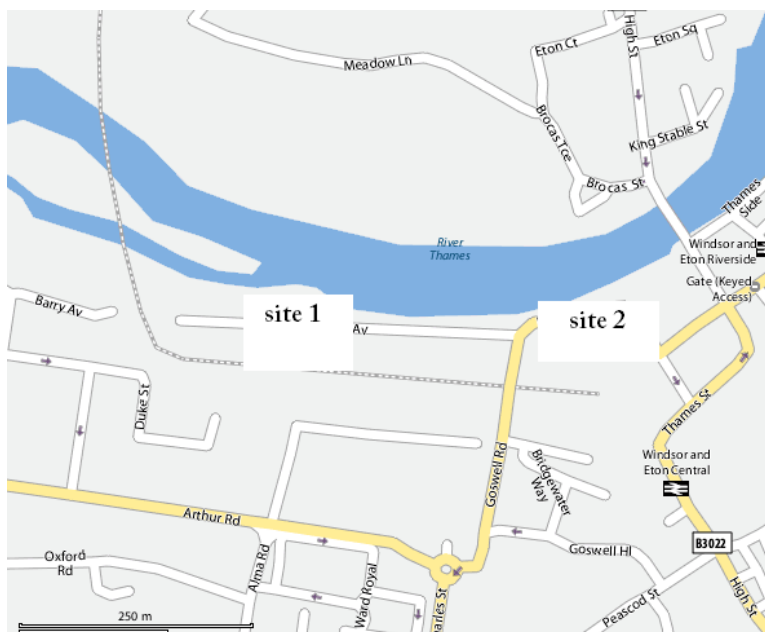
Figure 1. Showing locations of the two observation sights for focal sampling of the wild swan populations.