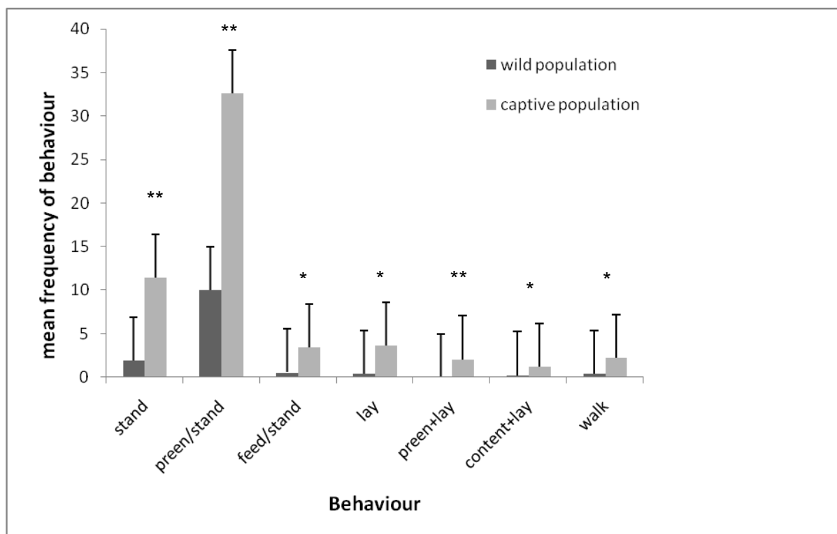
Graph 1. mean number of occurrences (SE±) of behaviours that were performed more significantly in the captive population compared to the wild.