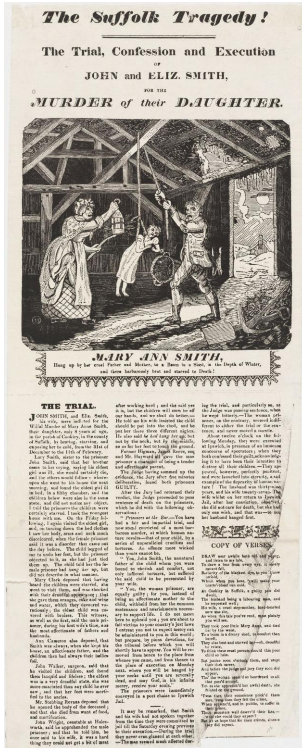
Figure 6: Smith Broadside