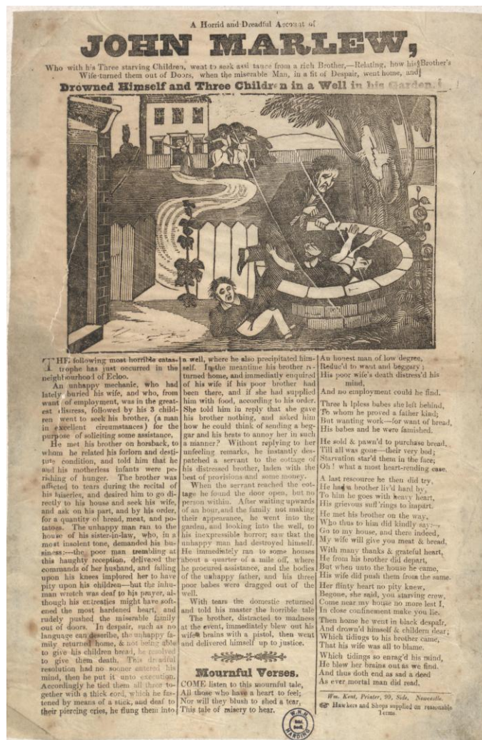
Figure 5: Marlew Broadside

interesting entrée into considering cultural representations of paternal child killing in the first half of the nineteenth century. While monstrosity was certainly an important theme, the broadsides also include narratives ameliorating the responsibility of the male killers. These concern bereavement, 'poverty' and inability to fulfil their role as provider, and the 'evil witch' narrative suggesting that the men's acts were crucially influenced by women who transgressed the boundaries of appropriate femininity. It is noteworthy that this latter narrative of women as the real villains behind male acts of child killing exactly reverses the cultural narrative of male perfidy underlying female acts of infanticide, discussed above in relation to the Fanny Amlett broadside.