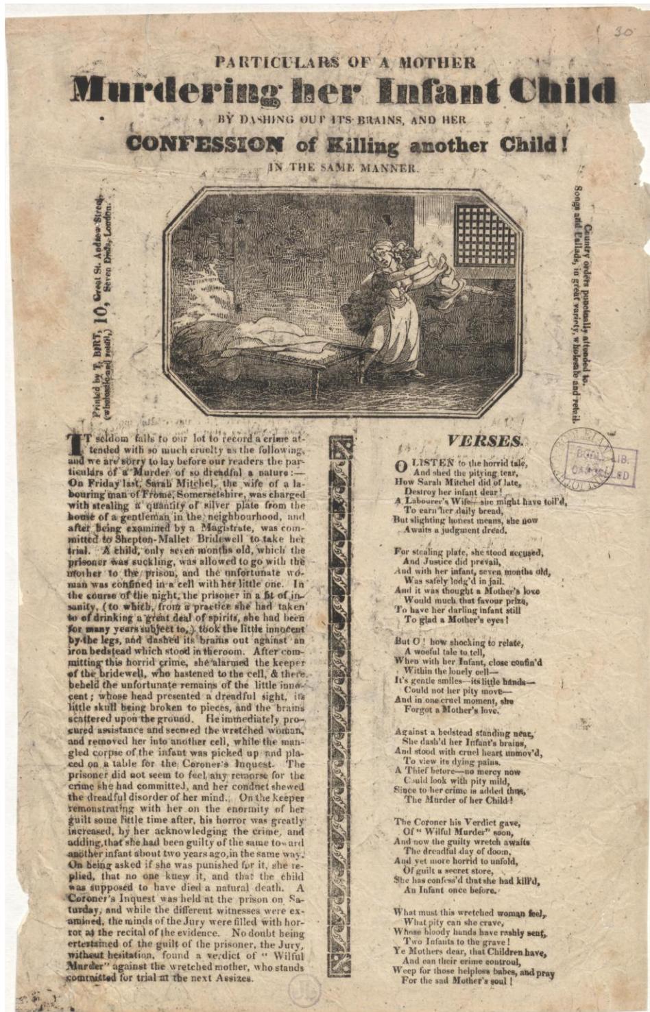
Figure 1: Mitchell Broadside

was common practice. 67 The rough yet powerful image depicts her in the very moment she seizes her child to kill it. Its dynamism provides the image with a dramatic and horrific narrative: the next moment will see the infant's head smashed against the bedstead.