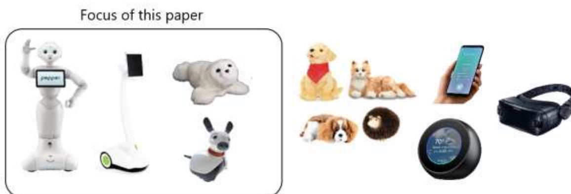
Fig. 1 Devices available for interaction during exhibitions: Pepper, Padbot, Paro seal, Miro, Joy for All dog and cat, Perfect Petzzz breathing dog, handmade knitted hedgehog, mobile apps, Amazon Echo Spot, virtual reality equipment

Alternative animal devices were available in our exhibitions, including the Joy for All cat and dog, Perfect Petzzz sleeping dog and a knitted hedgehog. However, data recording focused on interactions with devices that were 'undisputed' robots (Pepper, Paro, Miro and Padbot).