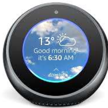
Figure 1. Amazon Echo Spot

Choice of smart speakers: We aimed to implement devices that offered the possibility of videocalls through a screen. In December 2018, the most appropriate device on the market was the Amazon Echo Spot (Figure 1) (Appendix). At Amazon's suggestion the Amazon Kindle Fire (Appendix) was trialled in some homes. Early feedback indicated Echo Spot devices were more physically robust and Kindle Fires looked more like 'regular tablets', which some homes owned and had limited use for. With this feedback, Echo Spots were distributed until October 2019 when they were discontinued. Subsequently, we offered homes the Echo Show 5 (Appendix).