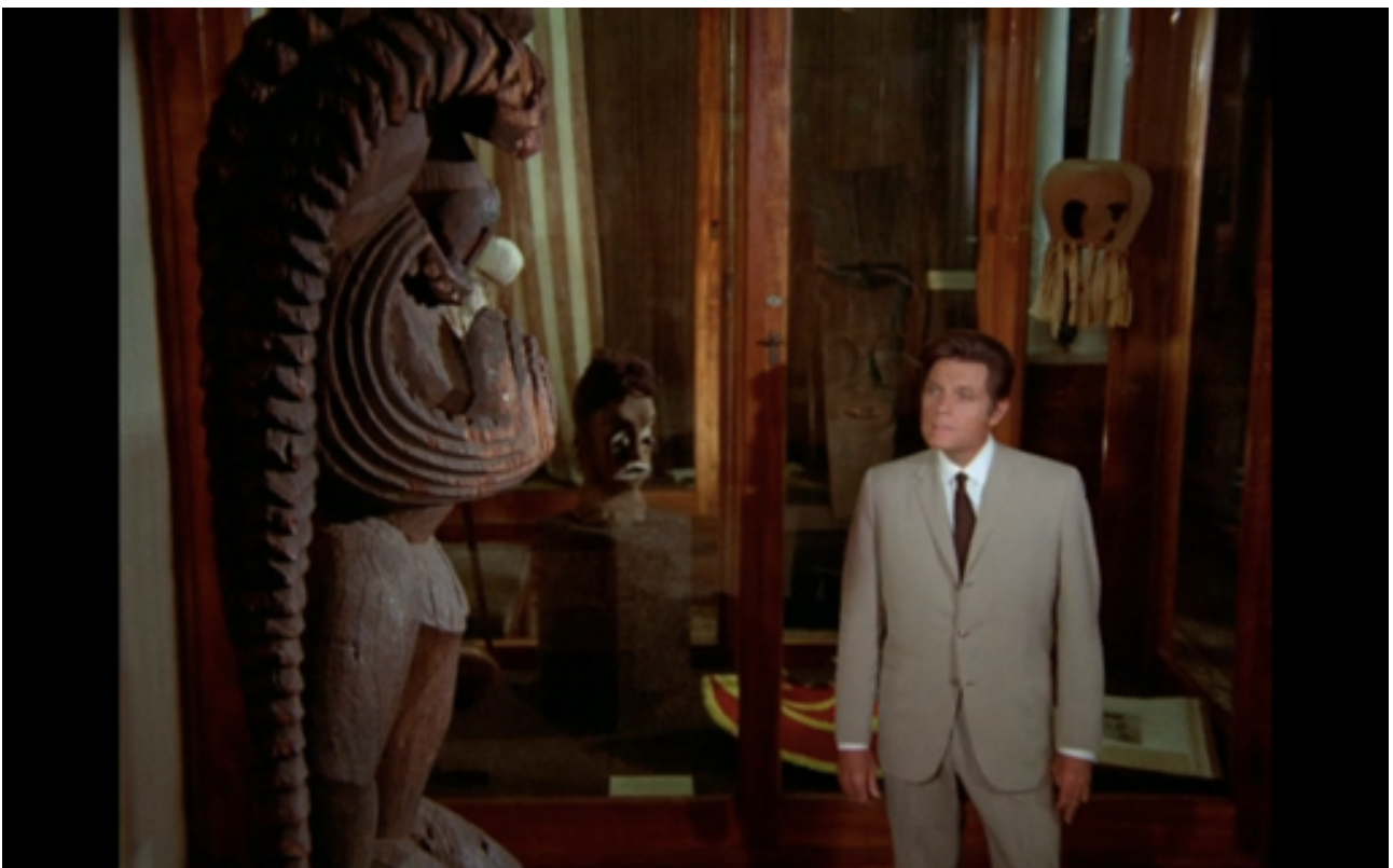
Image 2 - McGarrett considering the full body bust of Kū.