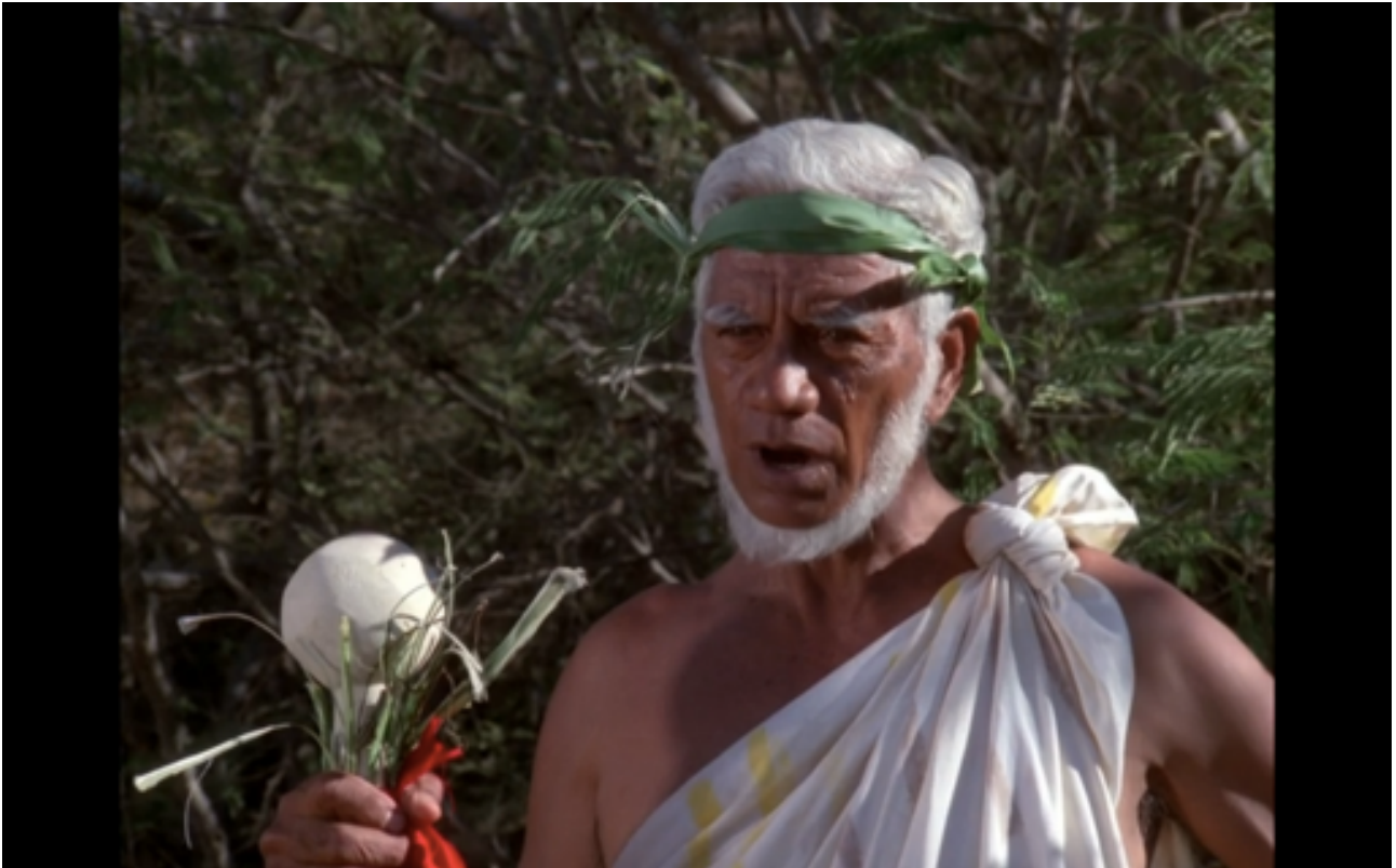
Image 5 - The Kahuna accosts Detective Truck Kealoha. He is wearing a headdress made out of ti leaves and a kīhei .