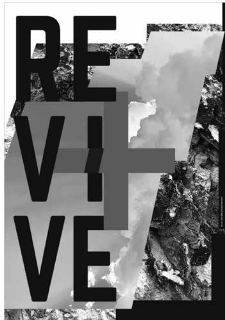
Revive + Message Covid-19 Special issue ©Kelly Salchow Macarthur Michigan, USA