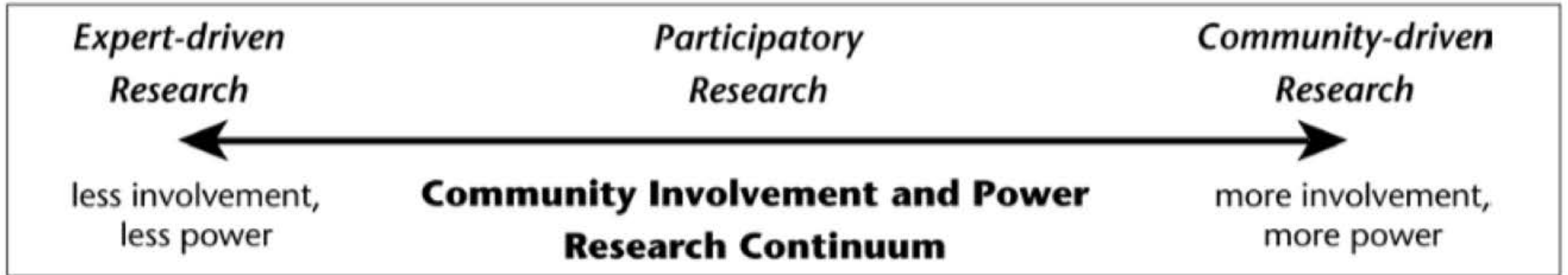
FIGURE 1. Community involvement and power research continuum.