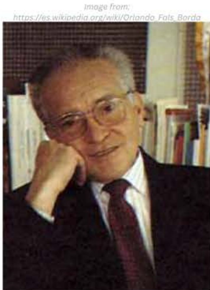
Orlando Fals Borda 1925 - 2008

PAR requires a strong commitment by participating social scientists to deprofessionalize their expertise and share it with the people, while recognizing that the communities directly involved have the critical voice in determining the direction and goals of change as subjects rather than objects. "