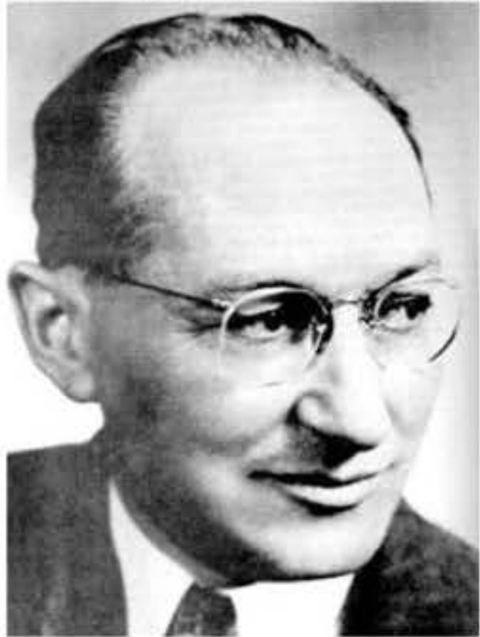
Kurt Lewin 1890 - 1947

image from: https://www.educare.it/jj/temi/scuola/scuola-e-dintorni/2893-la-teoria-del-campo-di-lewin-a-scuola