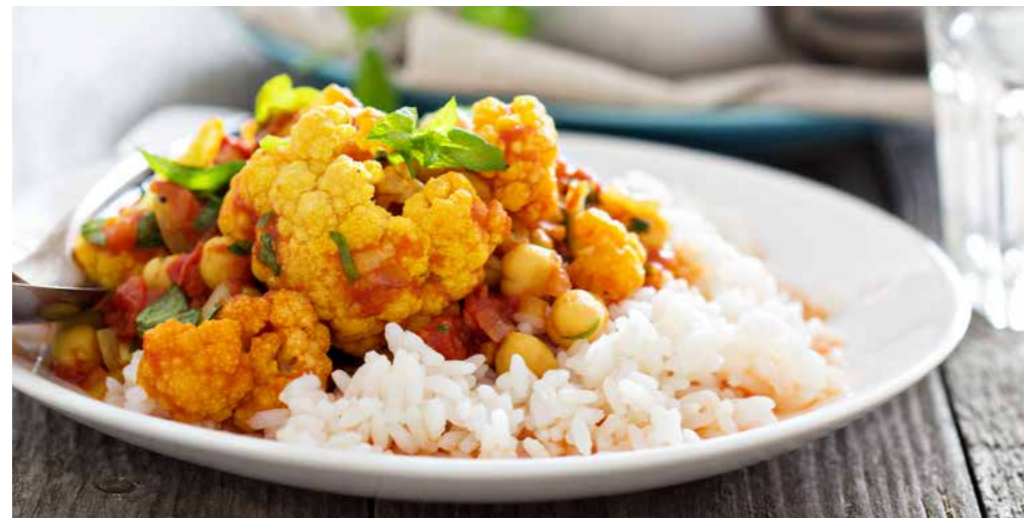
Seasonal, locally grown produce

human resources'. Translating and communicating what a sustainable diet looks like 'on a plate' is difficult however, even for nutrition professionals. This could potentially be supported by the introduction of professional standards in the area.