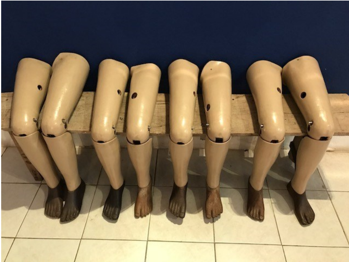
Figure 2: Legs

Another August. Another time. Five years ago. A year after my father died. I was so sad. So drained. So desperate. Still grieving. For my dad. Still furious at my body's betrayals.