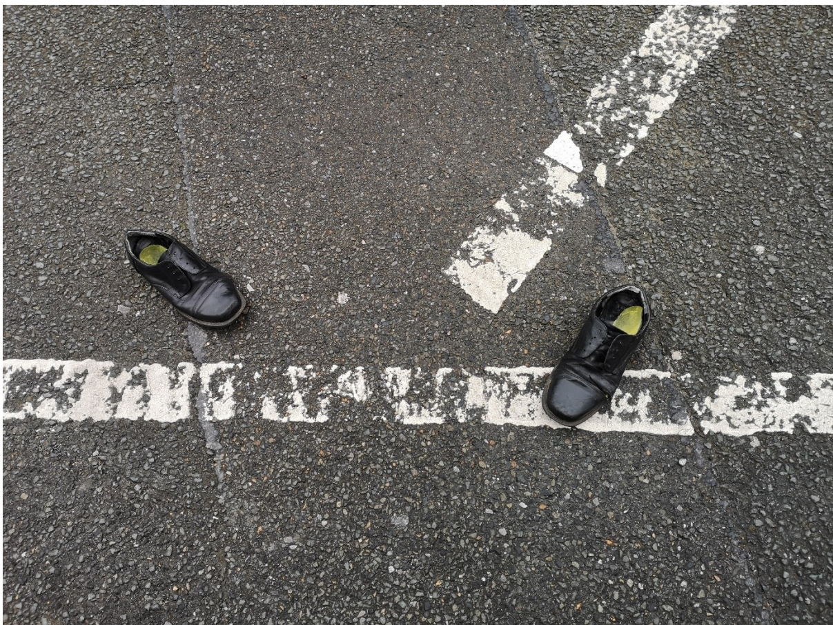
Figure 13: Two lost souls

The terrible scar on his side where his kidney was removed. His huge ribcage. Black curly hair. High forehead like my dad's. Peanut they used to call him. And worse. The nearest our tiny white village had to a person of colour. The eldest boy by default. Never able to take the place of the blue-eyed boy who had come first and been lost. Sickly as a baby. Uncoordinated. Bad at sport. Terrible teeth dragged into line by monstrous braces. Nose bleeds so bad there would be blood up the walls. Lonely. Bullied. Lying in the dark listening to Pink Floyd.