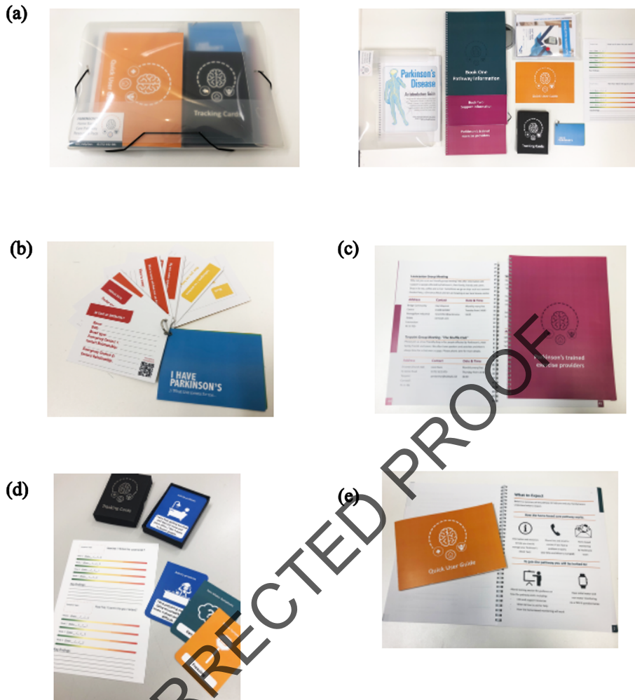
Fig. 3. Home-Based Care resource pack. (a) The Home-Based Care Pathway pack; (b) Parkinson's patient passport; (c) Service and local information; (d) A card deck to support self-reflection; (e) A self-management support and general information package. The pack included information about Parkinson's service provision and support available for PwP and care partner; details of a single point of contact; information about Parkinson's disease; information and guidance for symptom monitoring and management; lifestyle advice; a Parkinson's patient passport to capture key aspects of Parkinson's important to the PwP.

(MDS-UPDRS II)), the Non Motor Symptoms Questionnaire (NMSQ), the Parkinson's Disease Sleep Scale 2 (PDSS2), and the Hospital Anxiety and Depression Scale (HADS). A bespoke questionnaire on medications and the main concerns of PwP and their care partners was also created (see Questionnaire 1, Supplementary Material).