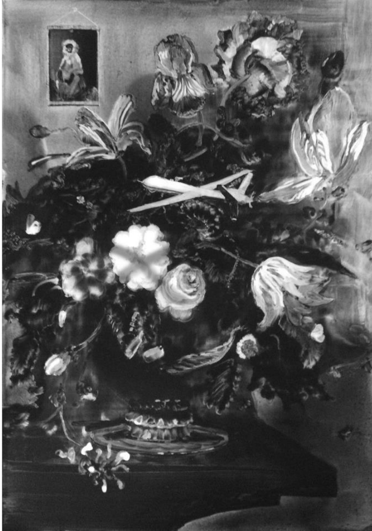
Sq.48 Reconnaissance 2020 private collection UK