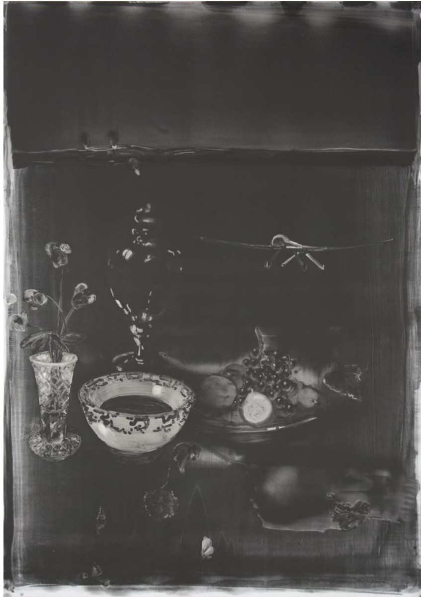
Sq.40 Reaper returns 2018 courtesy Frestonian Gallery London