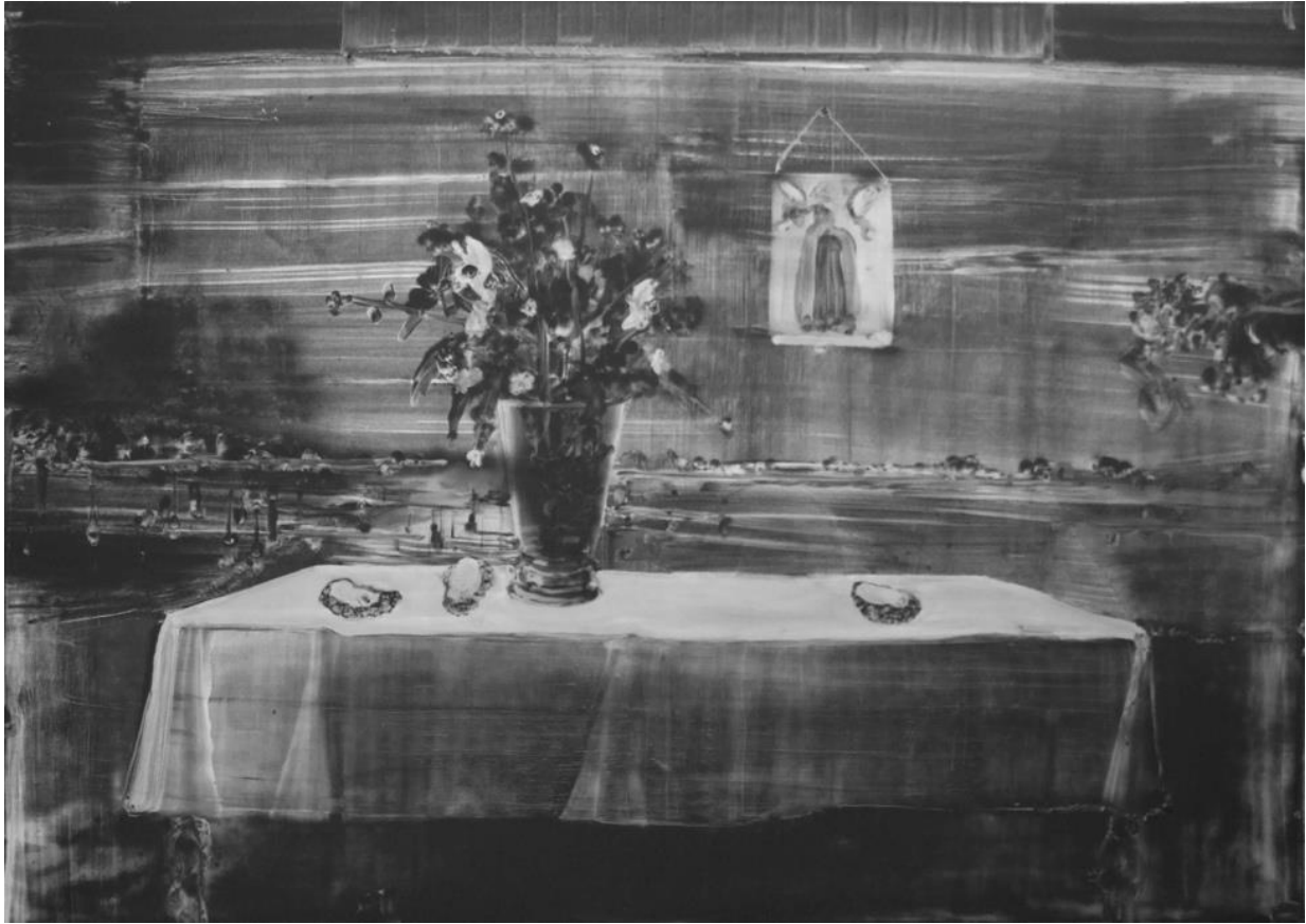
Sq.1 Untitled 2016