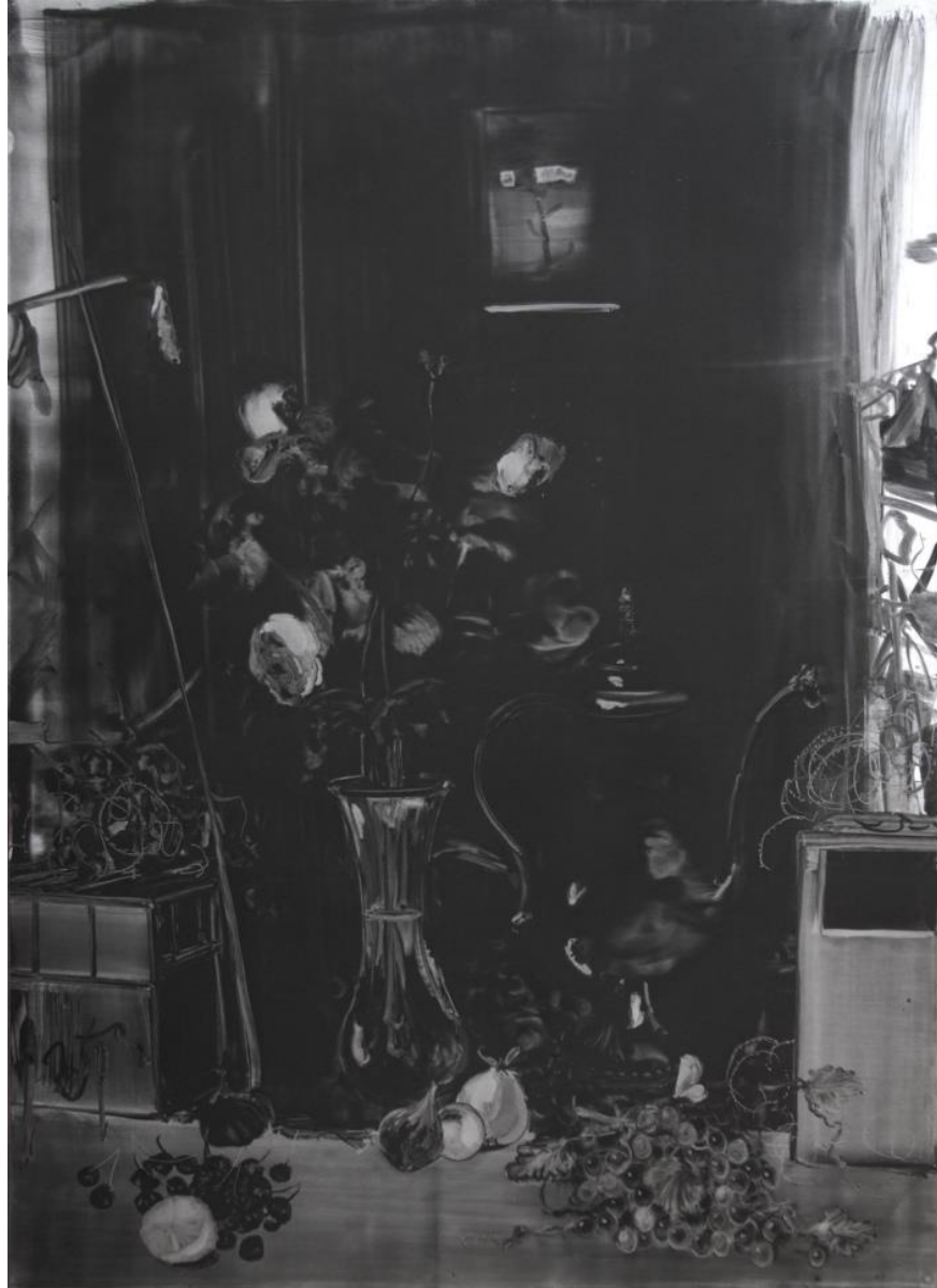
Sq.34 No man's flowers 2017