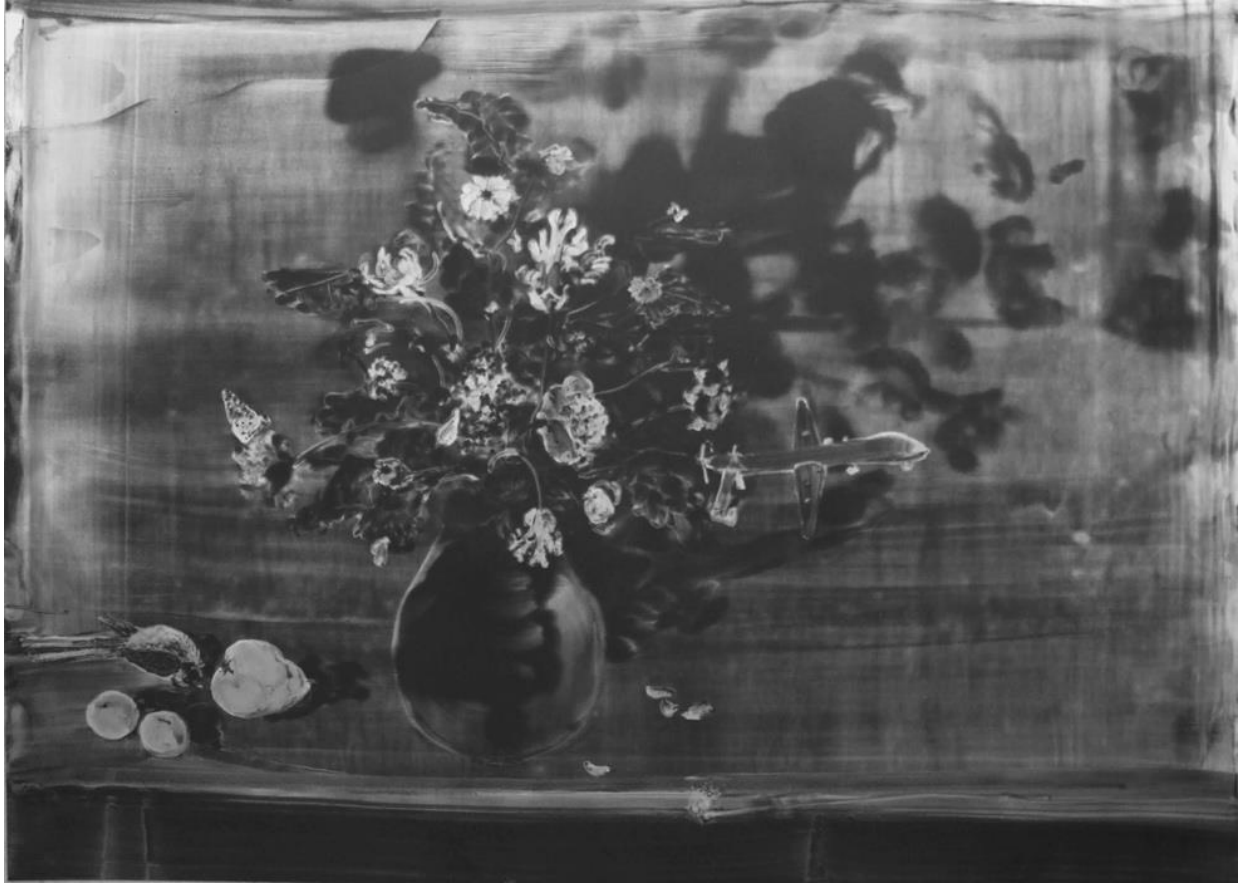
Sq.15 Shadowy 2017