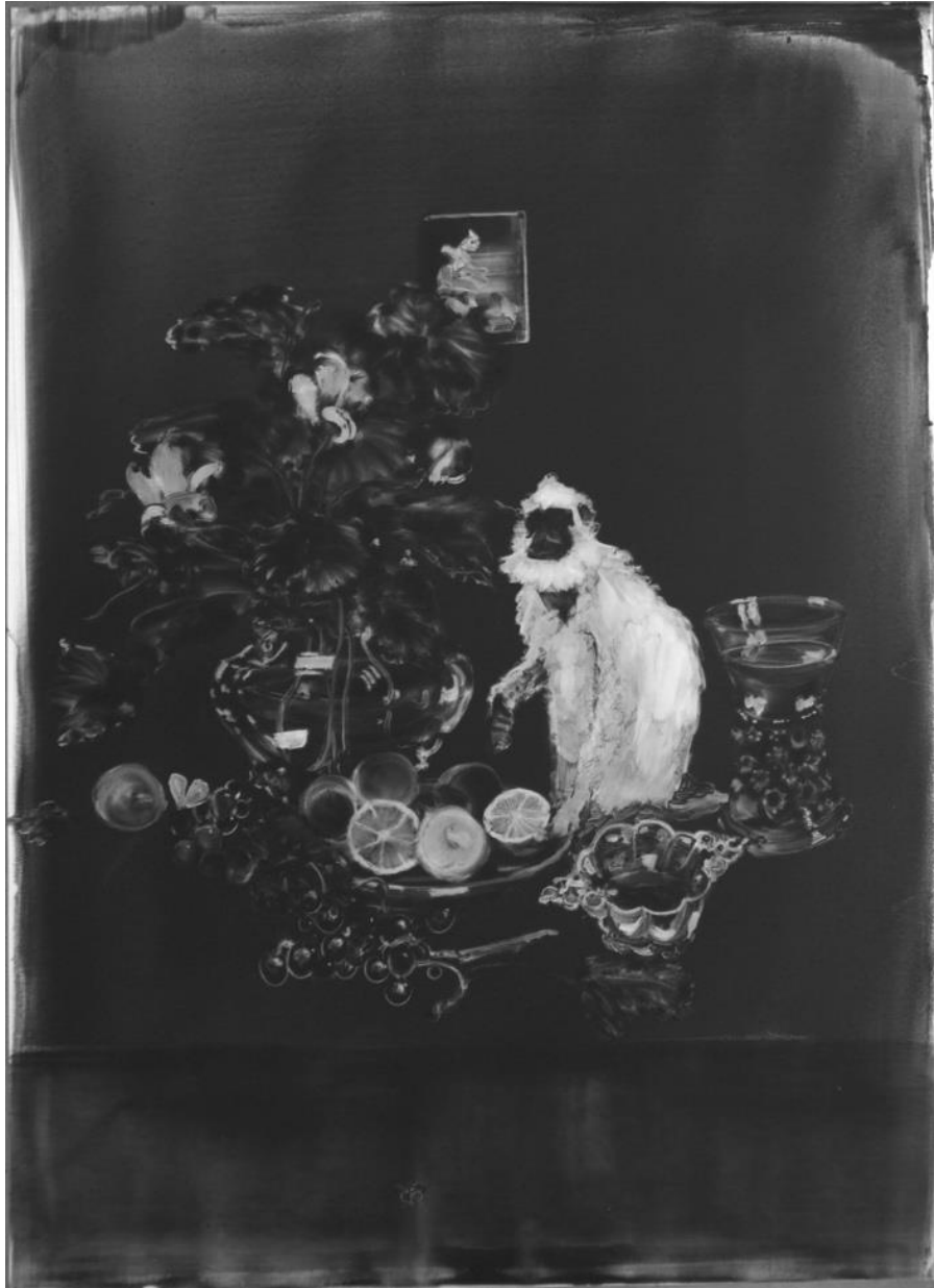
Sq.23 The Thief 2017