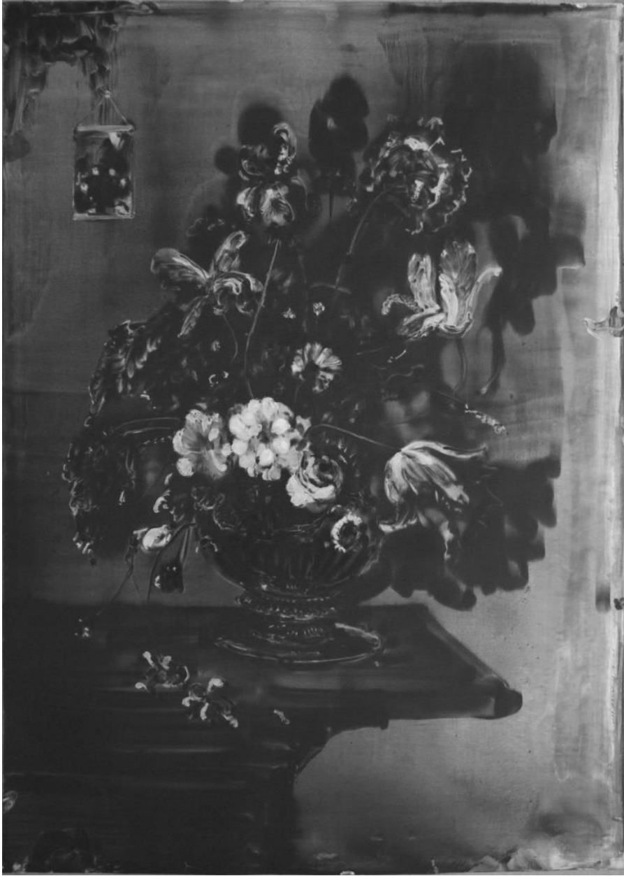
Sq.25 Teetering 2017