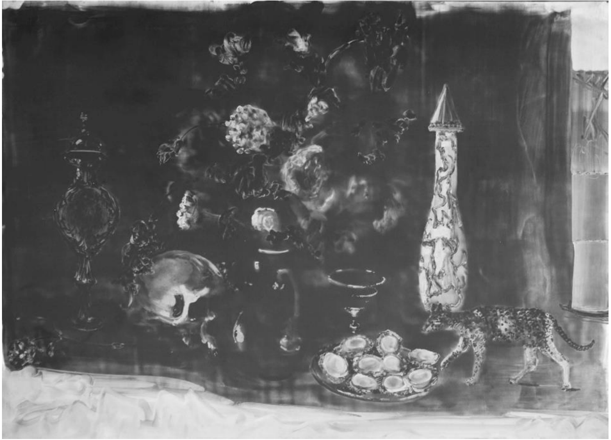
Sq.31 Minaret vase with cat 2017