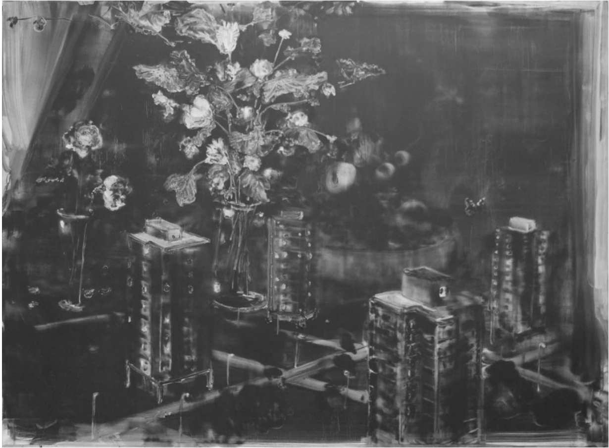
Sq.10 Reflected still life 2016