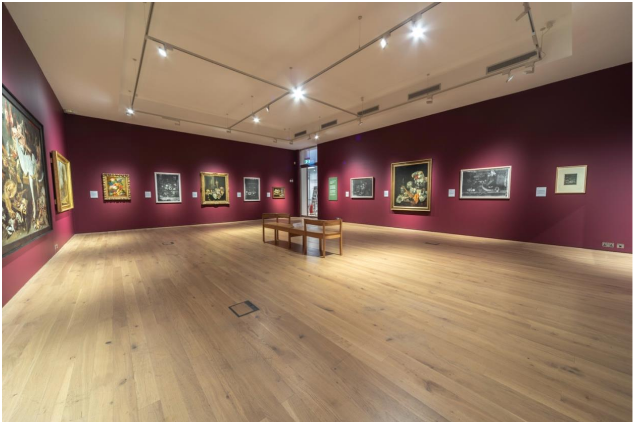
York Art Gallery during the first iteration of Making a Masterpiece , October 2019

The catalogue was reprinted to accompany two solo exhibitions of the still life works at Saul Hay Gallery Manchester and Sunny Art Centre London. Memento Mori (Sq.42) was purchased by York Art Gallery for its permanent collection, whilst Turvy (Sq.45) was purchased subsequently by the University of York and Global Reach (Sq.46) by the University of Plymouth. Panopticon was toured by the New Light exhibition to several UK venues.