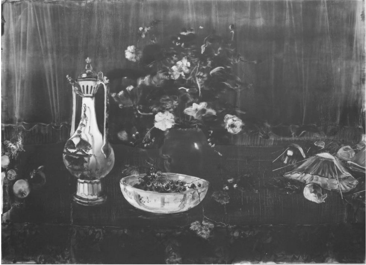
Sq.22 Encroachment 2017