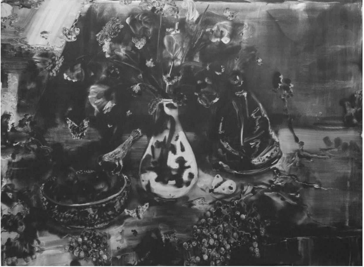
Sq.2 Untitled (with helmet) 2016