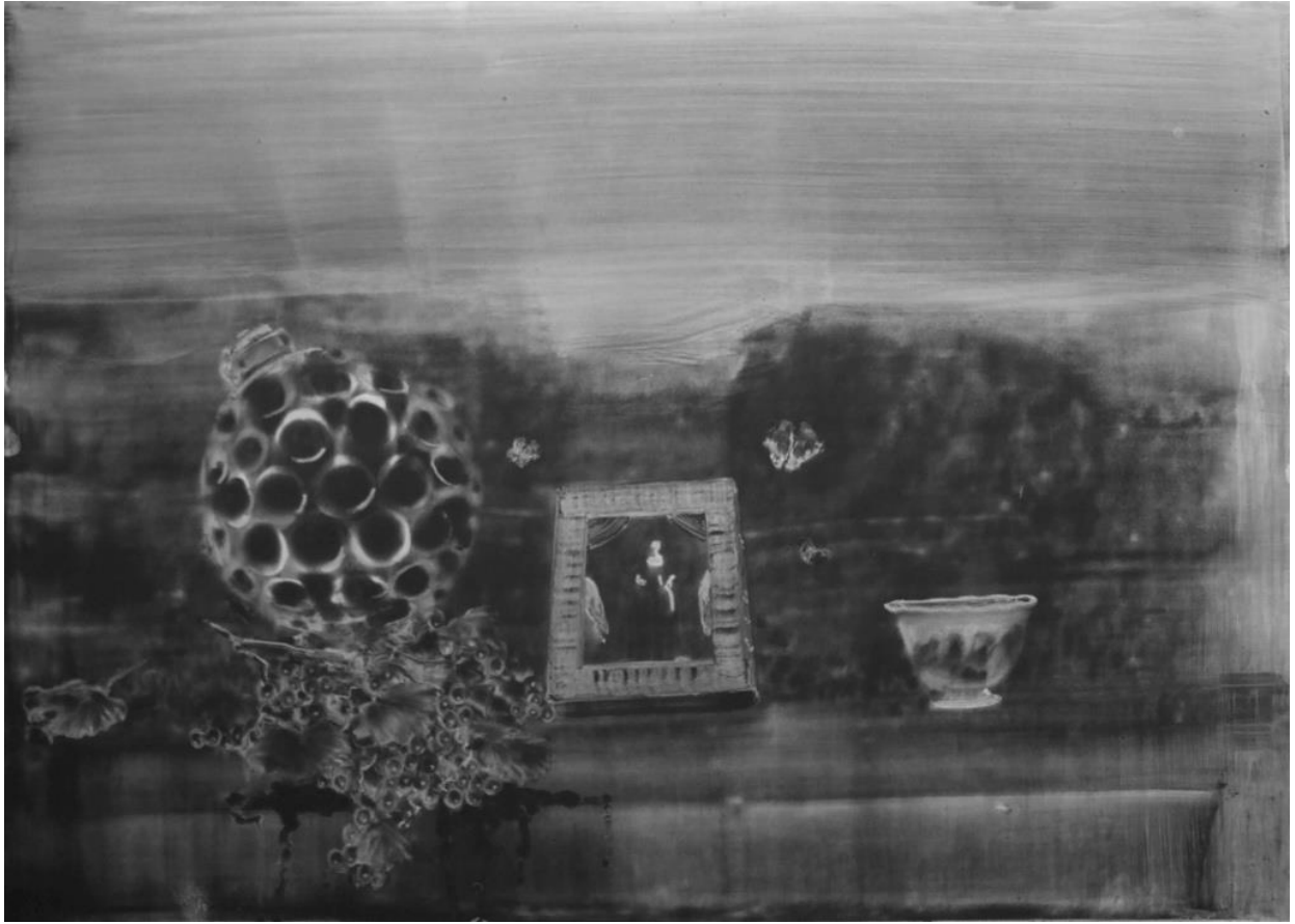
Sq.28 Madonna of the munitions 2017