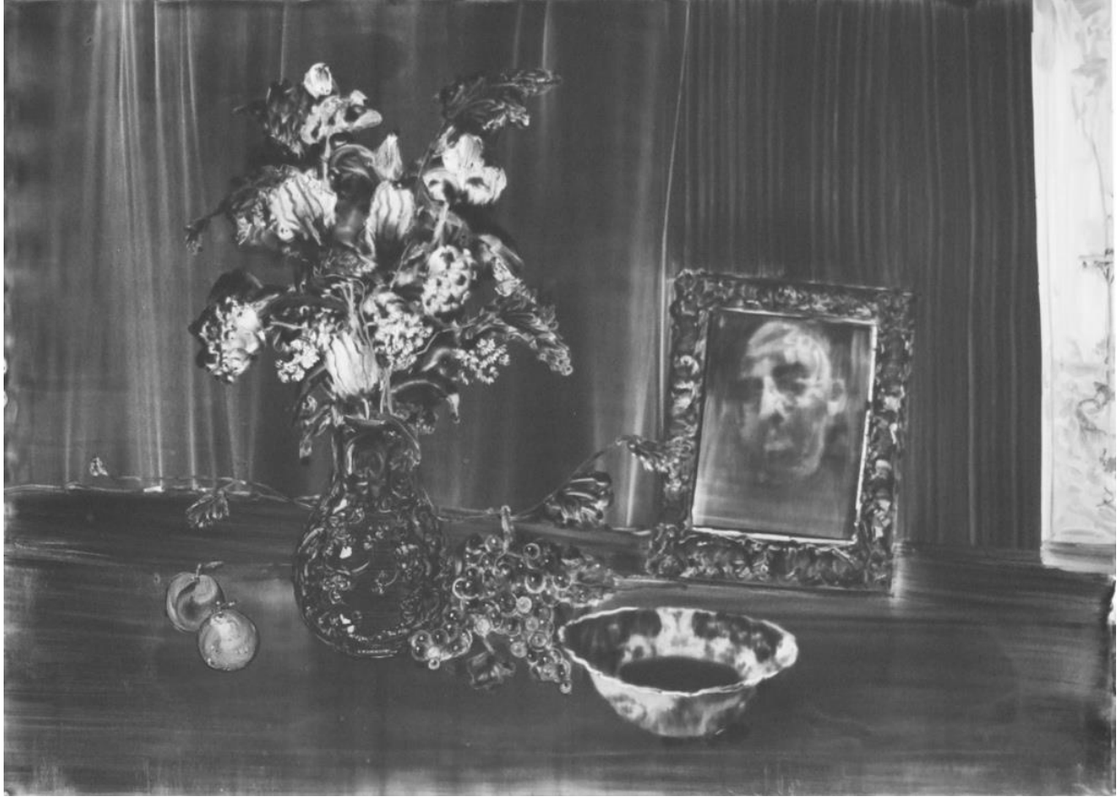
Sq.11 Still Life with self-portrait 2016