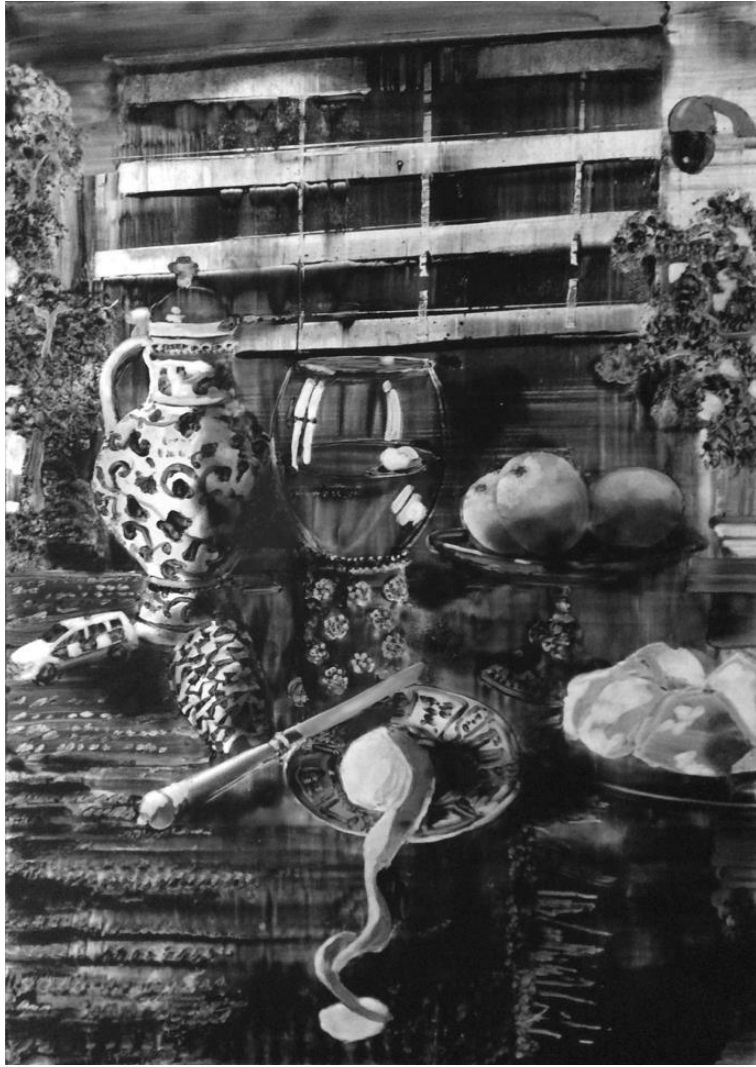
Sq.47 Checker 2020