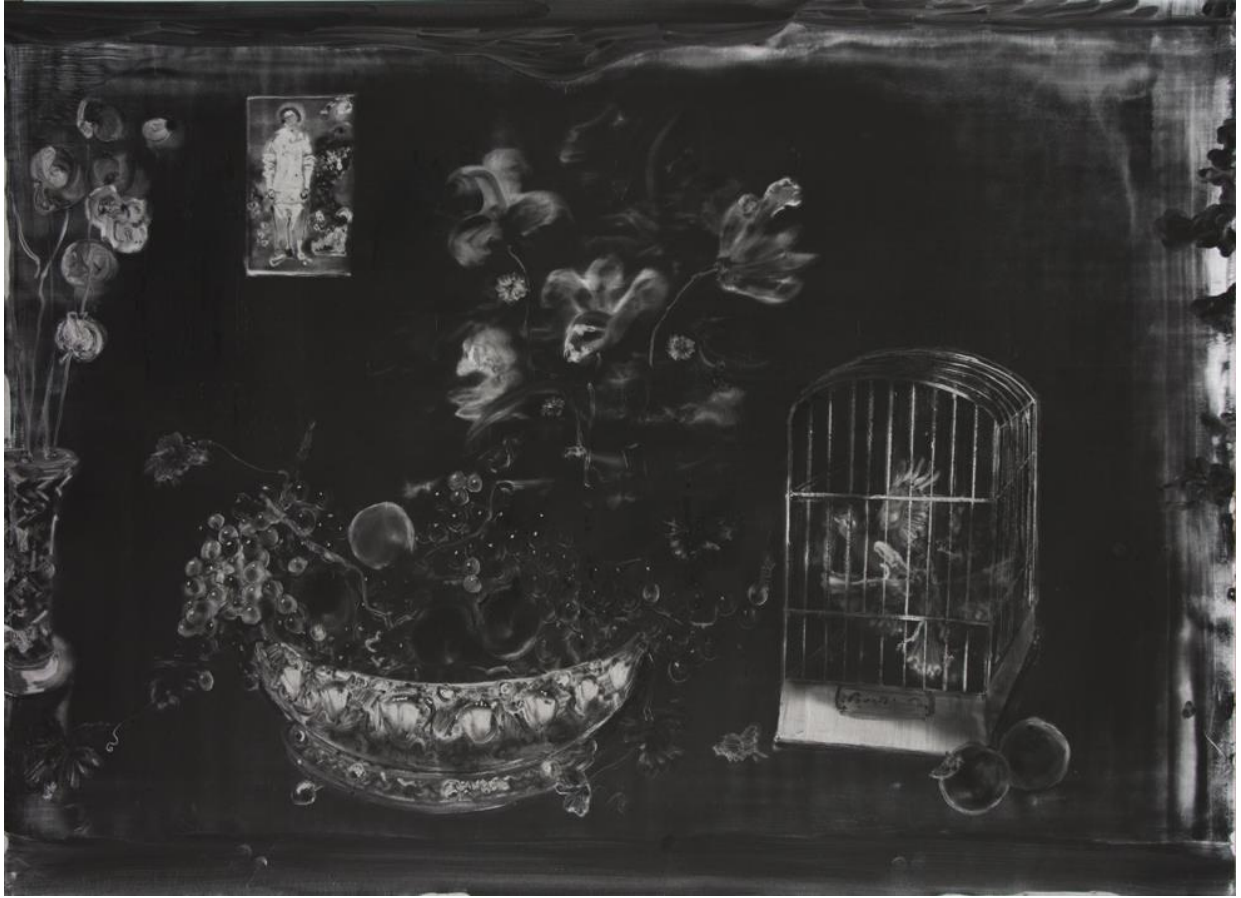
Sq.5 Birds are furious 2016