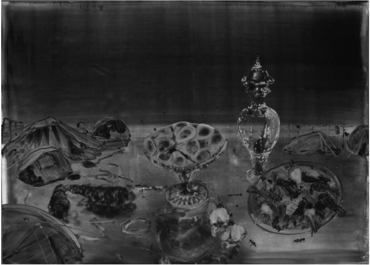
Sq.19 Encampment with oysters 2017