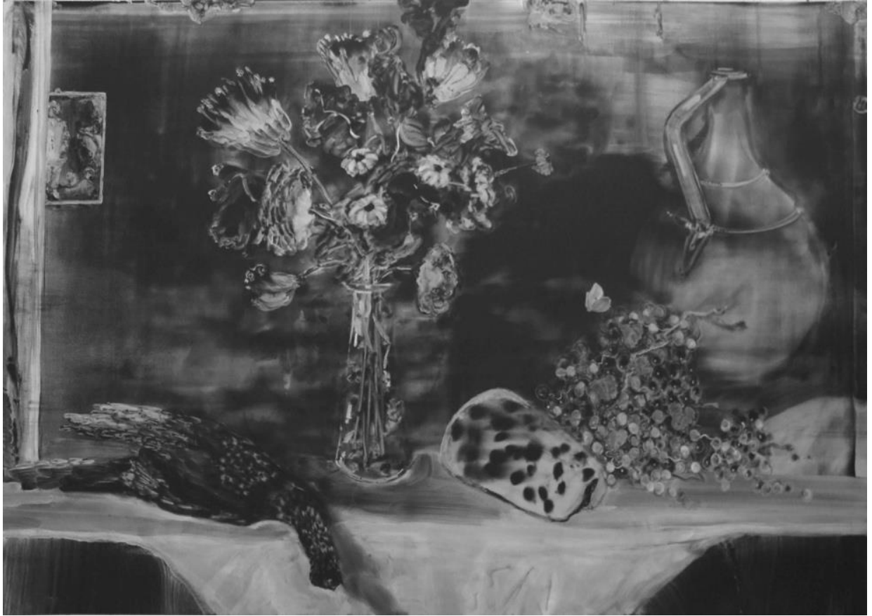
Sq.4 Still Life with Pheasant and conch 2016