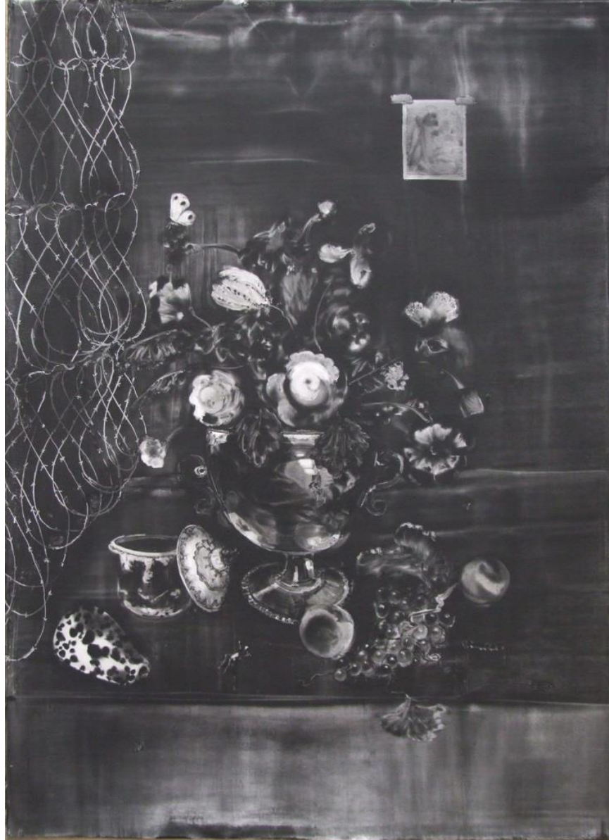
Sq.32 Figure 8 wire 2018 i courtesy Mary Ryan New York