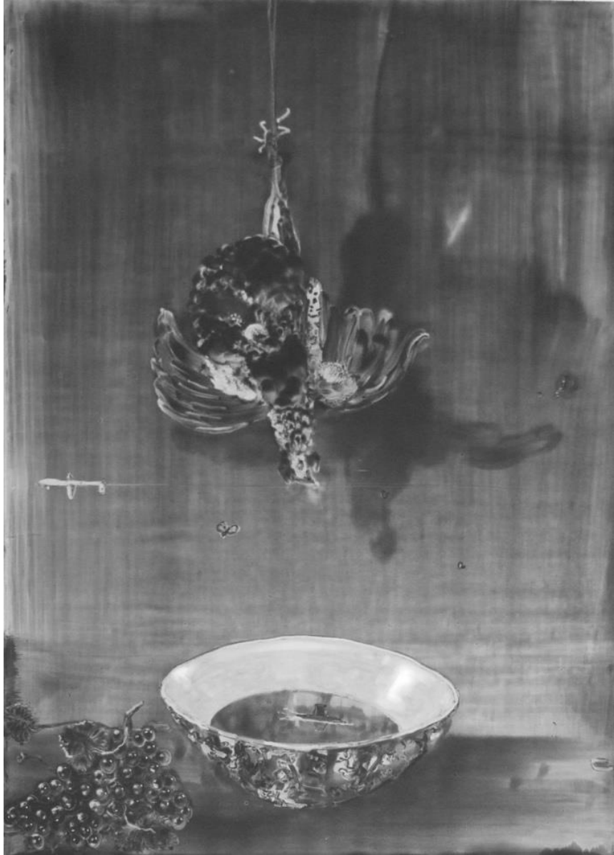
Sq.37 Preparations 2017