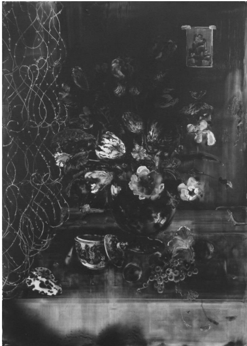
Sq.39 Figure 8 wire ii 2018