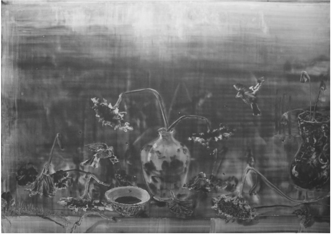
Sq.16 Sunflowers with bowl of ink 2017