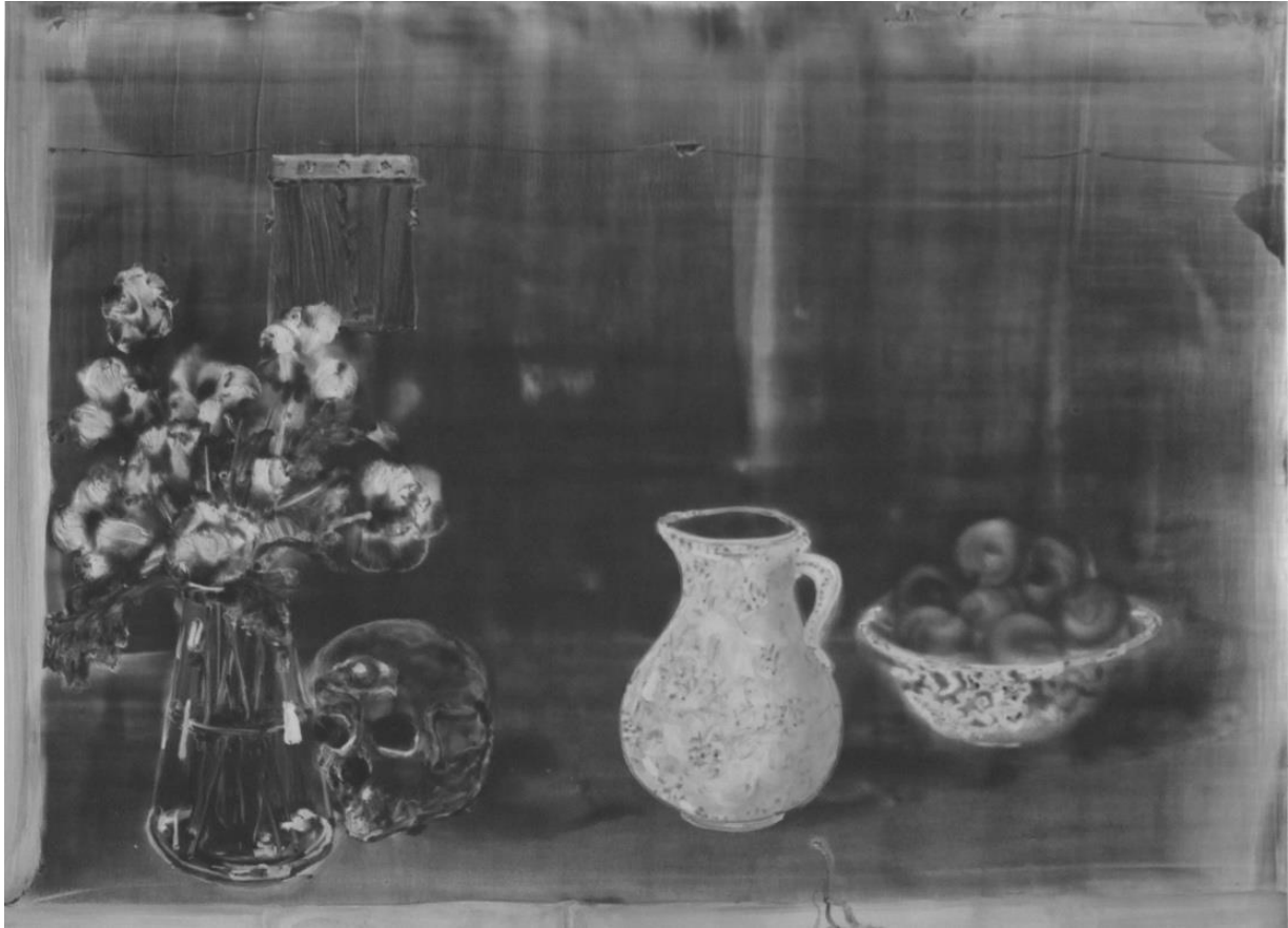
Sq.7 Still Life with black glass skull 2016