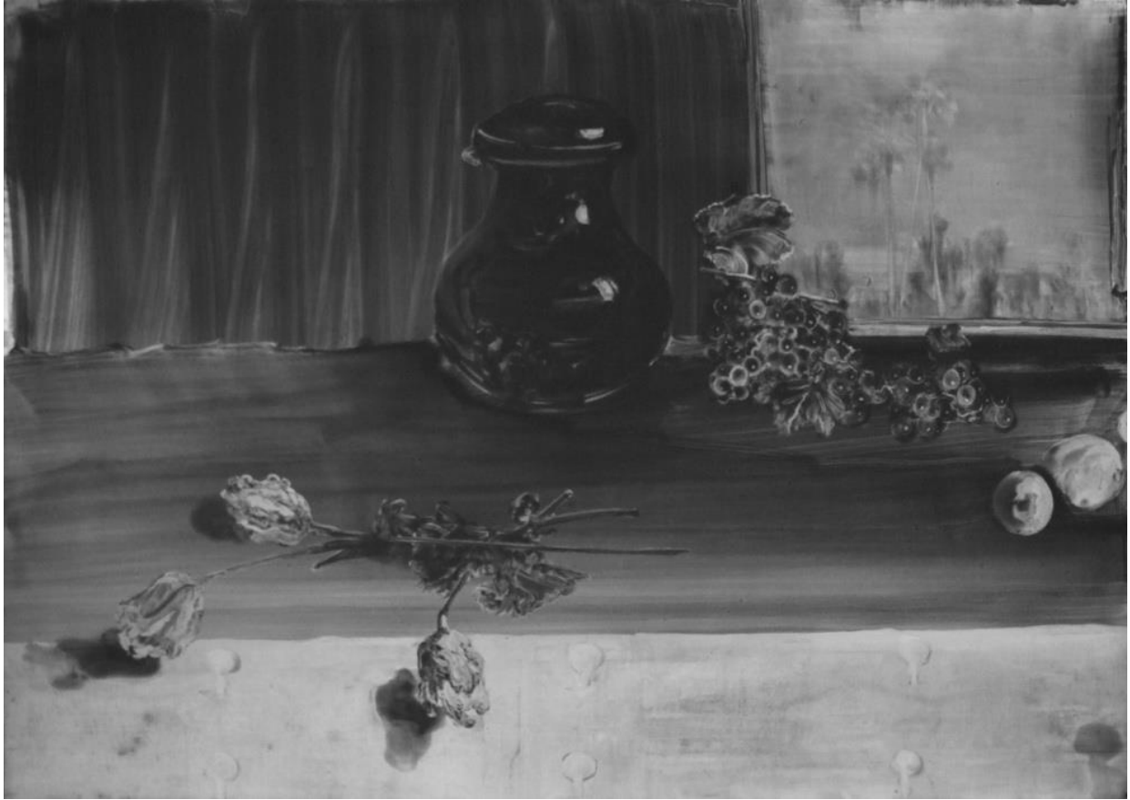
Sq.6 Memento mori 2016