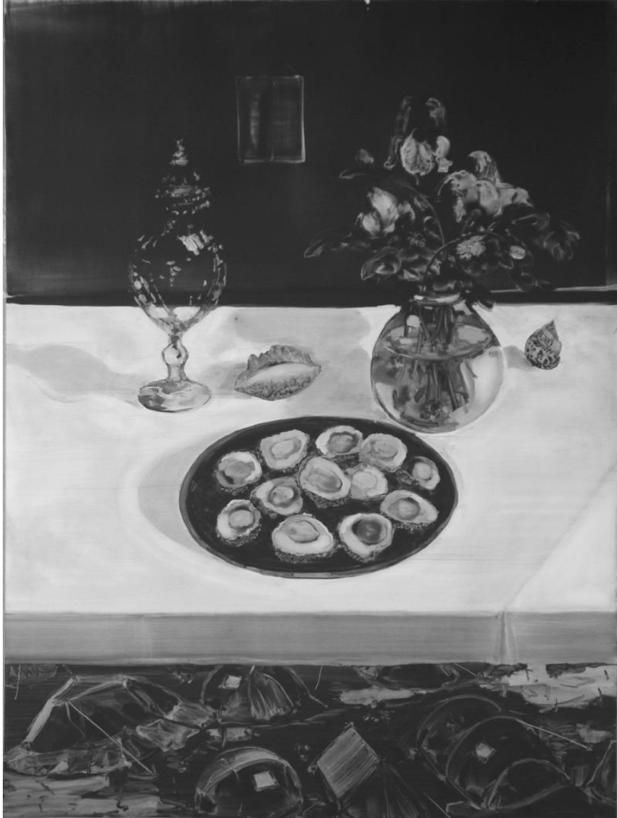
Sq.18 Under the Table 2017