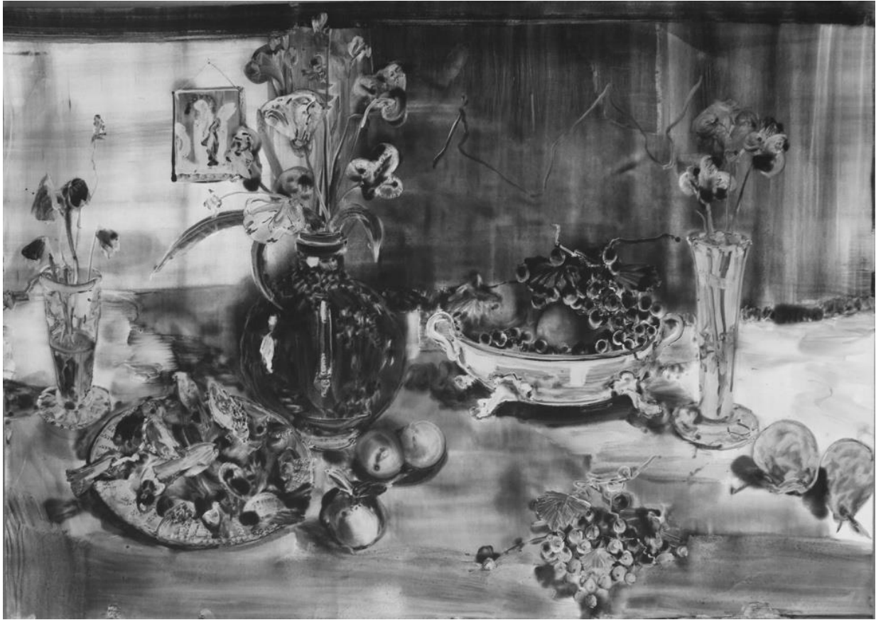
Sq.8 Still life with platter of birds 2016