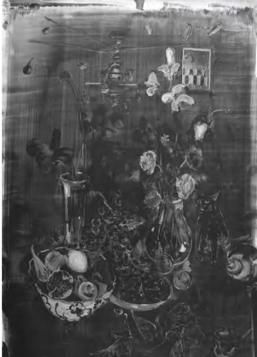
Sq.30 Postcard from Nicosia 2017 Collection NiMAC Cyprus