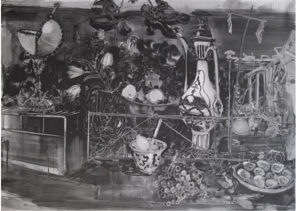
Sq.33 Lookout vase 2017