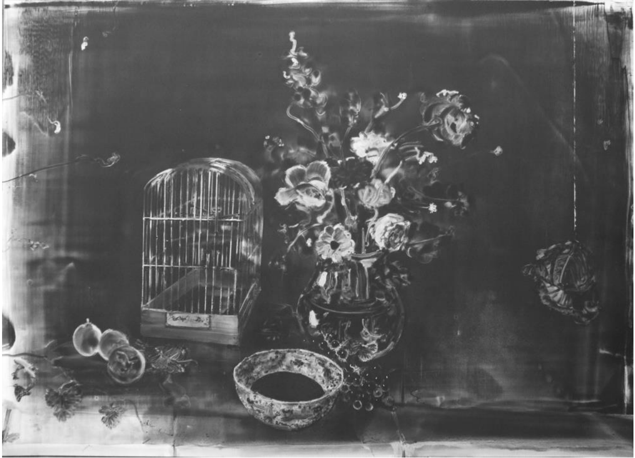
Sq.13 Furious Birds 2017