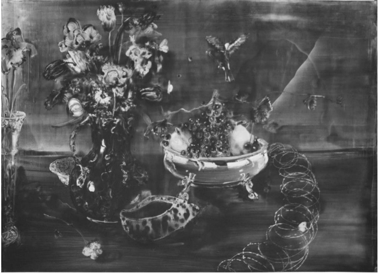
Sq.17 Razor Wire 2017