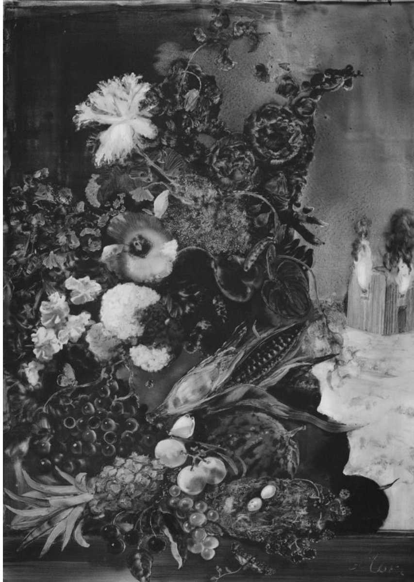
Sq.42 Memento mori 2019