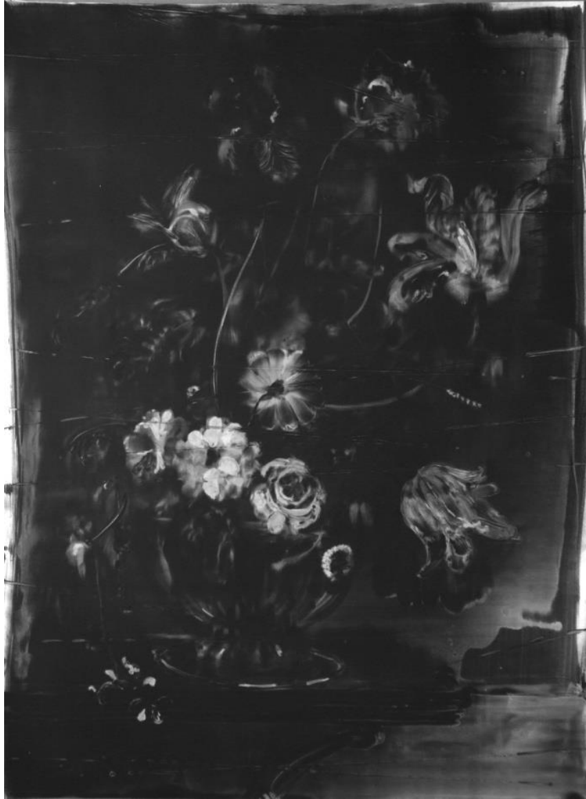
Sq.26 Crossfire 2017