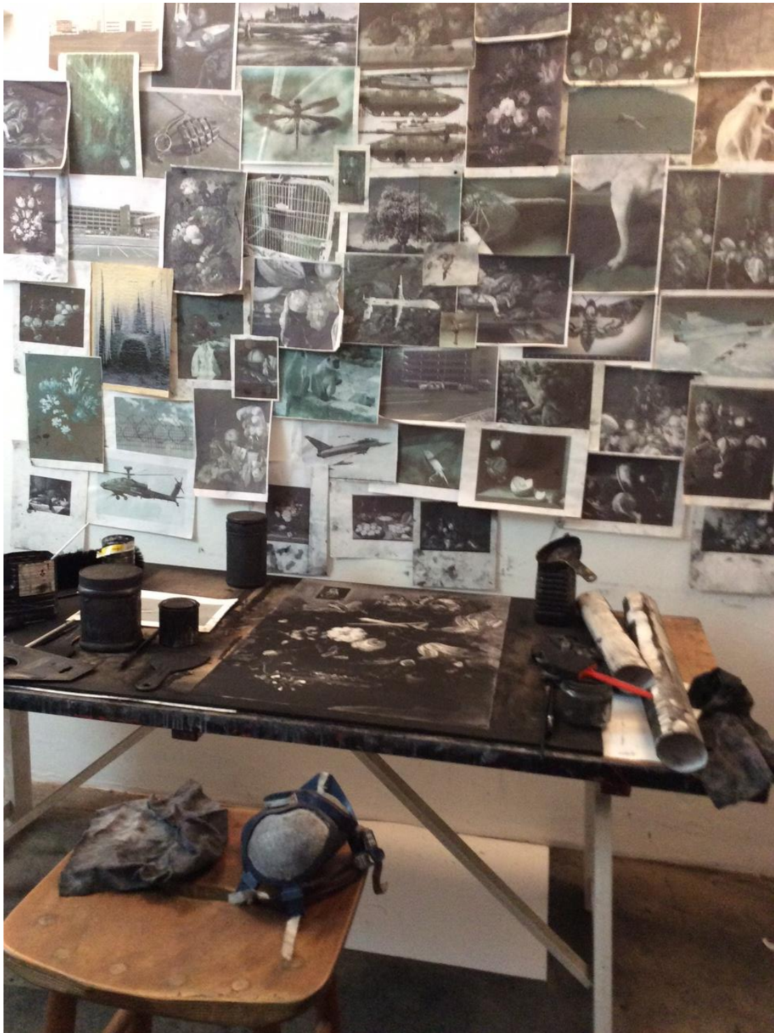
Part of the image archive on the studio wall in 2019 – the work in progress is Reconnaissance (Sq.48)