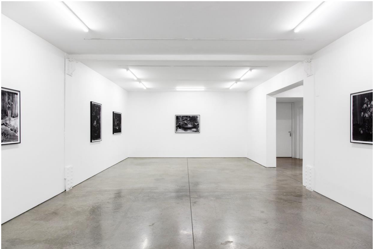
Installation shot of Gallery Two, Ryan Lee New York

In Still life with Eurofighter (Sq.38) a composite flower still life is slashed by two fighter jets (representing a European force) taking off from the tabletop, as if scrambled to protect the still life from imminent threat. The punctum here was the rising masculine energy of the vase as it obscures the female, vulva-shaped melon, introducing a gender dynamic to the militaristic atmosphere. Still Life with Reaper and bowl of ink (Sq.20) was an early image in which the still life space was modified by miniaturised allusions to the contemporary, the Reaper surveillance drone substituting for a vanitas skull, both emblematically and through linguistic pun.