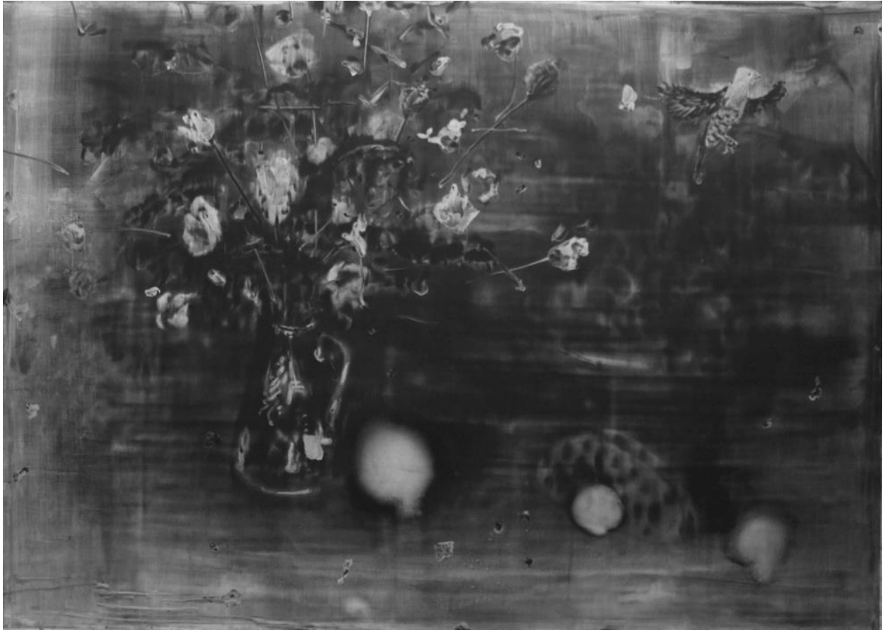
Sq.14 Three explosions 2017