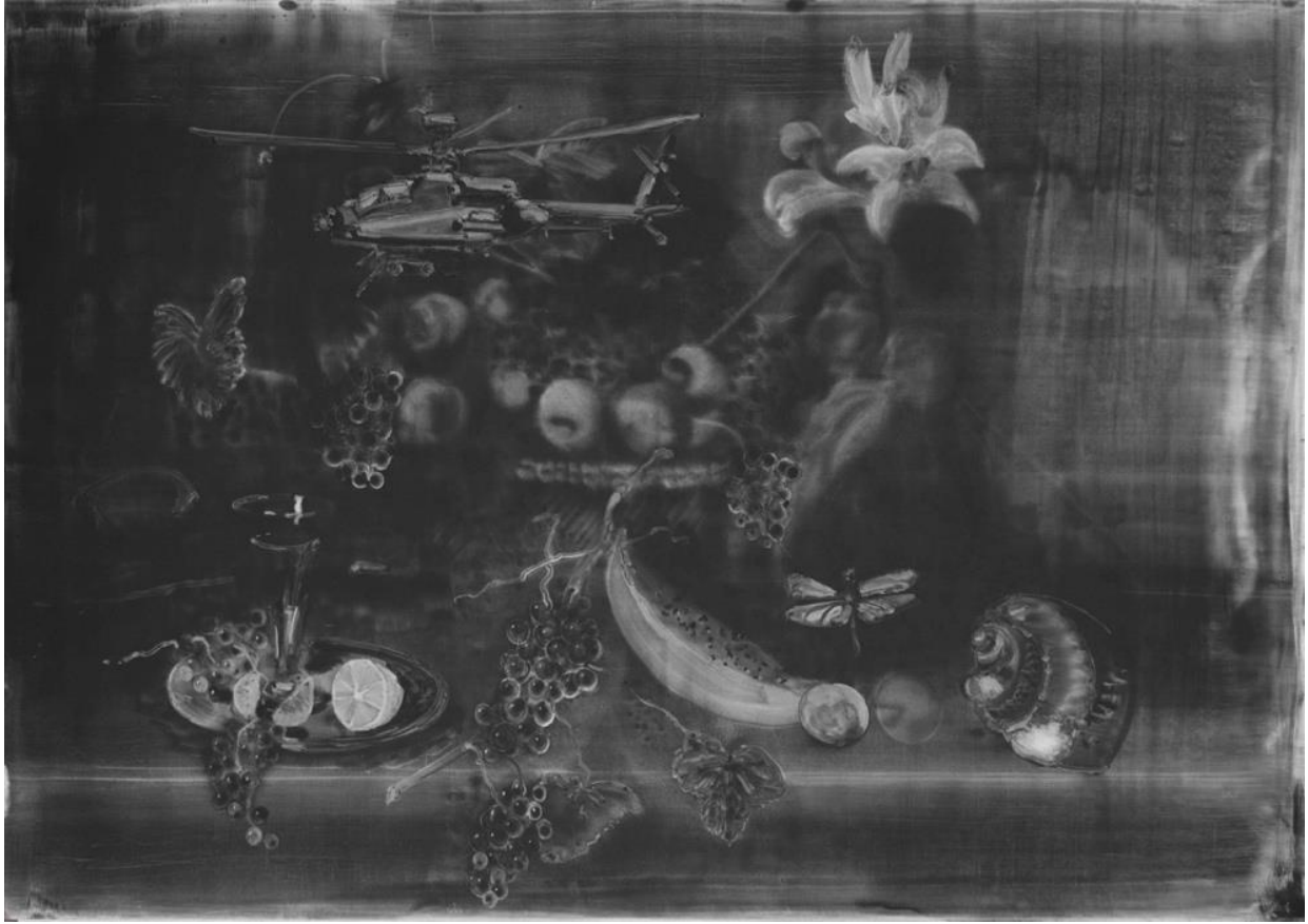
Sq.21 Still Life with dragonfly 2017