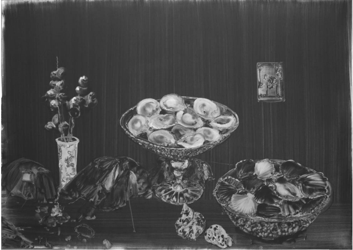
Sq.27 Still life with oysters 2018