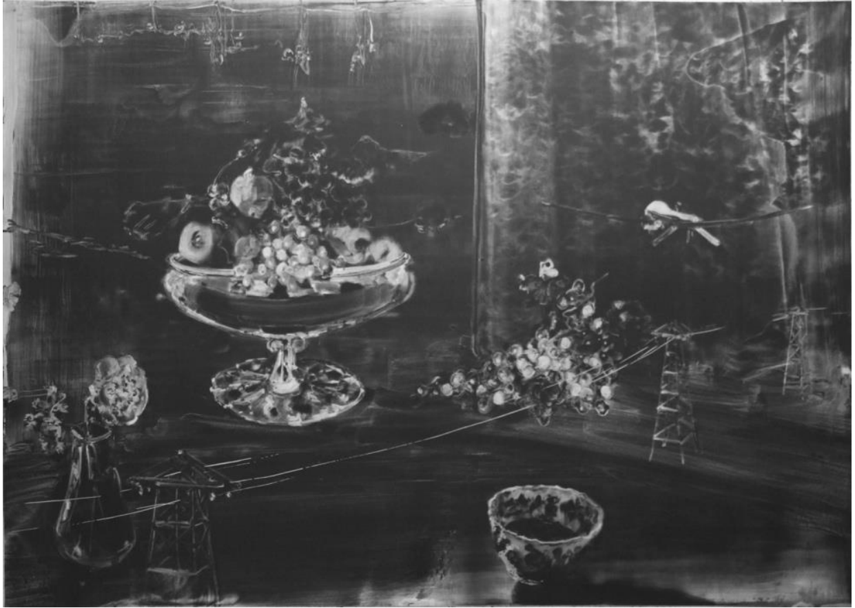
Sq.20 Still Life with reaper and bowl of ink 2017