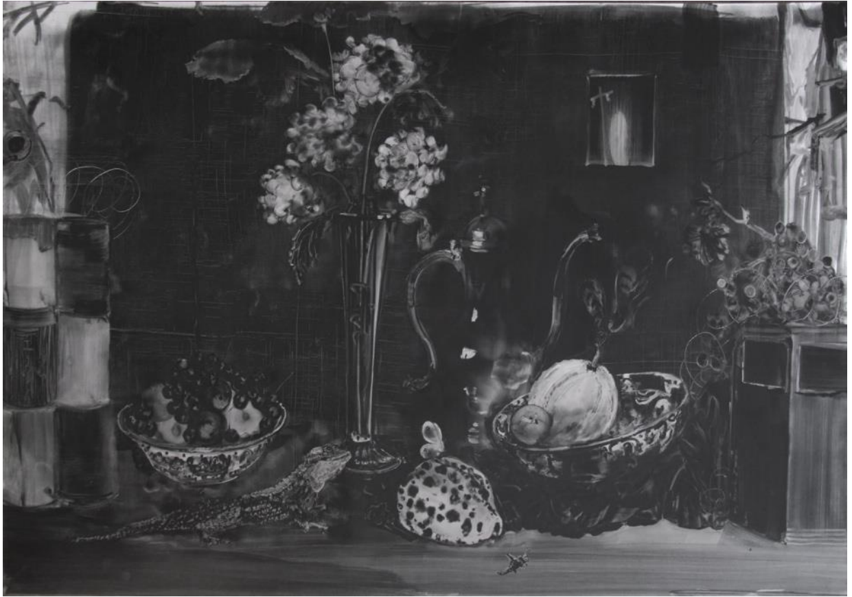
Sq.35 DMZ still life 2017