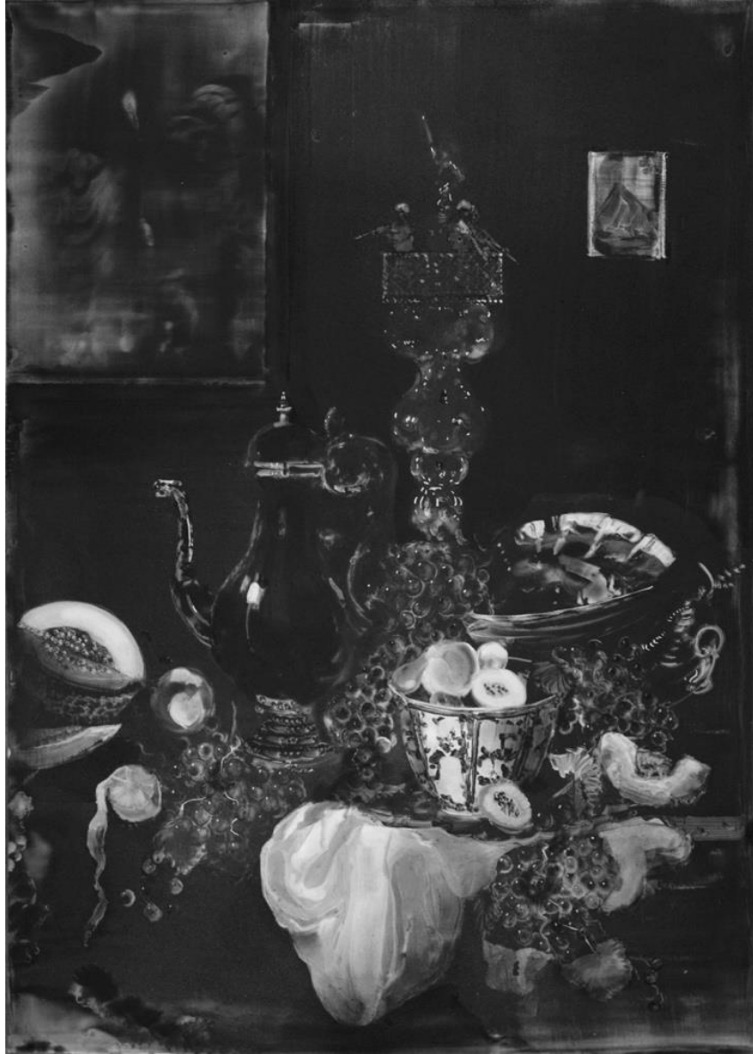
Sq.43 Panopticon 2019