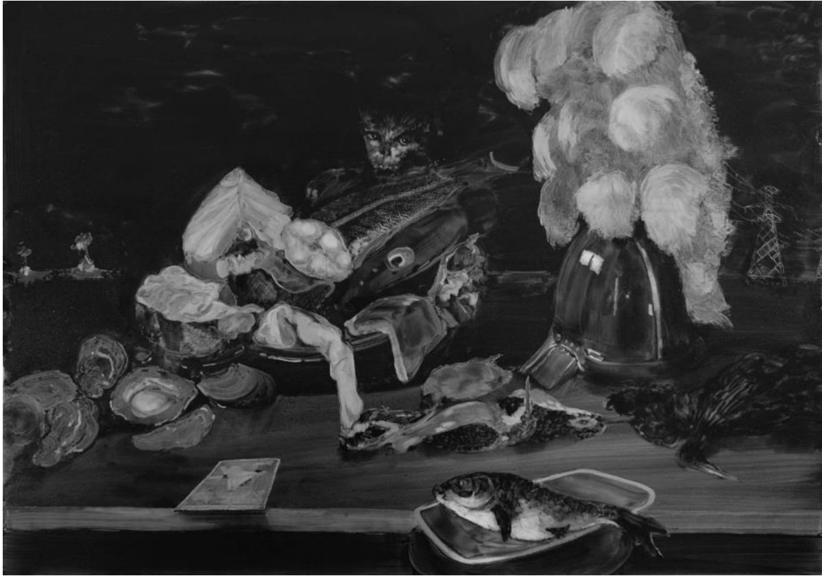
Sq.44 Top Predator 2019