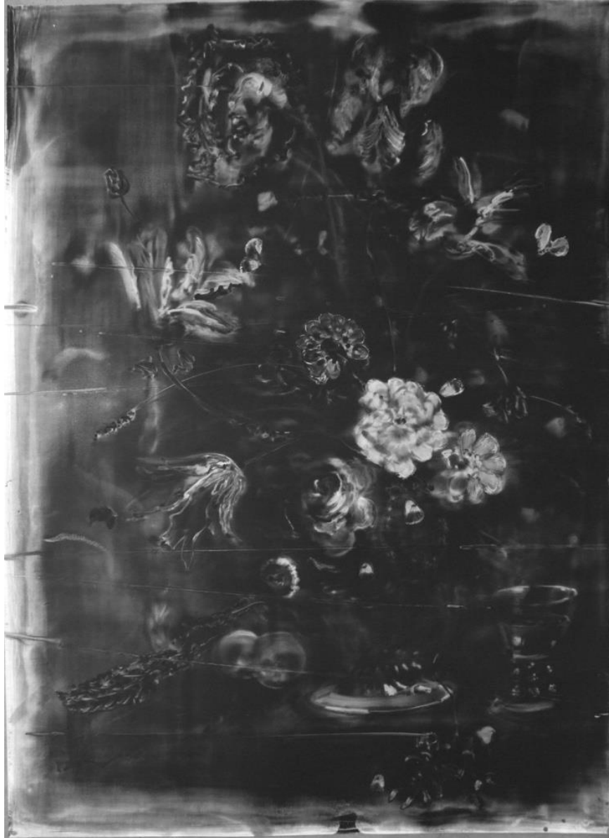
Sq.29 Crossfire ii 2018