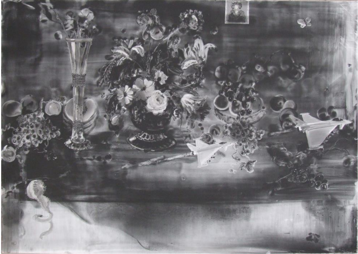
Sq.38 Eurofighter 2018