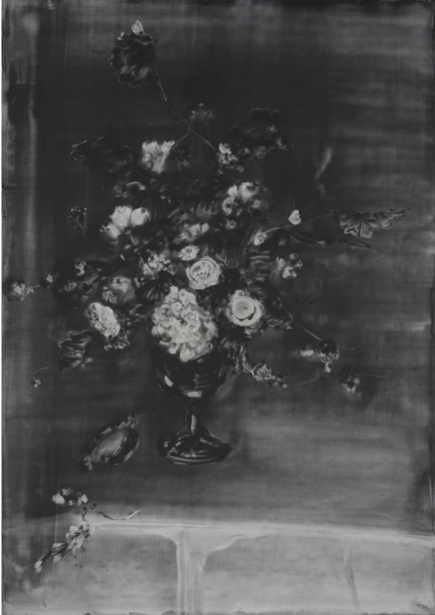
Sq.9 Vase of flowers with dead bird 2016 collection the artist