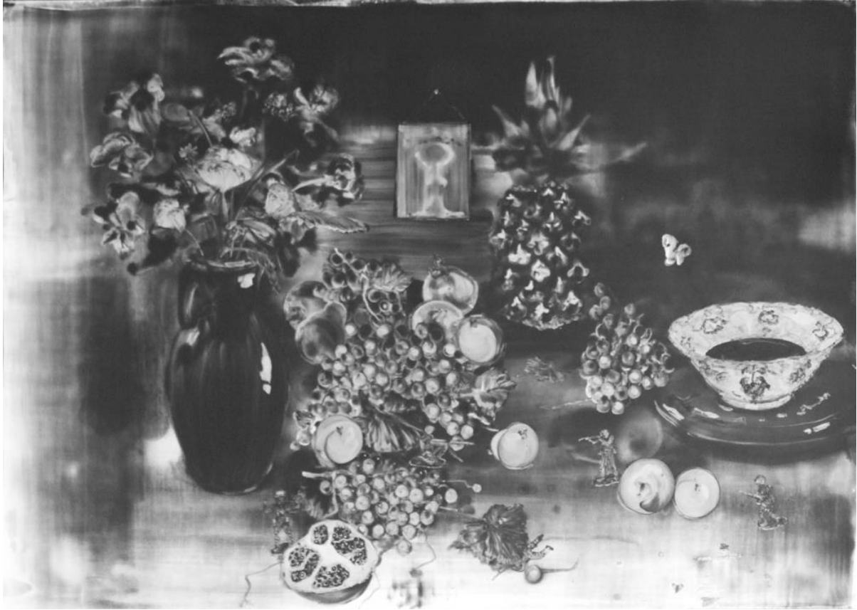
Sq.36 Skirmish 2017