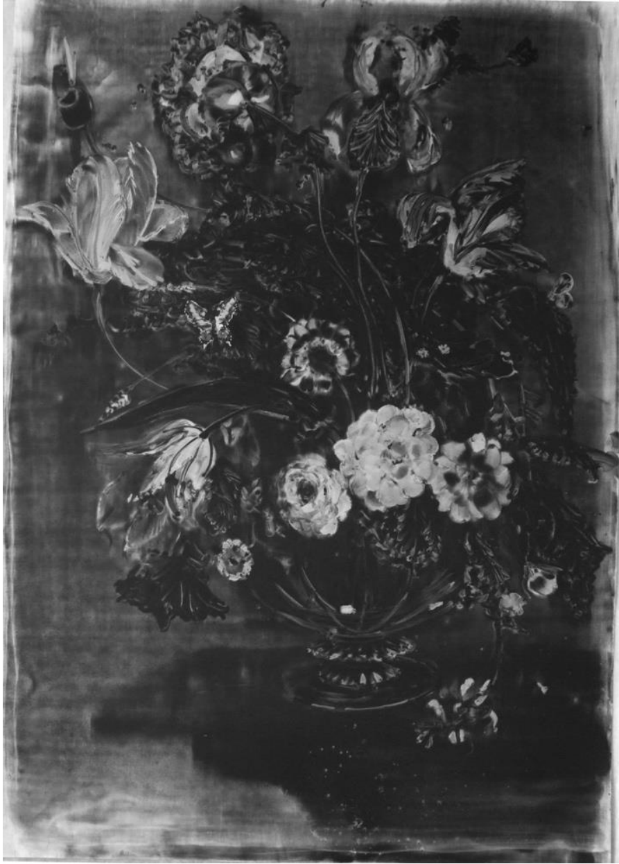
Sq.24 Vase of flowers 2017