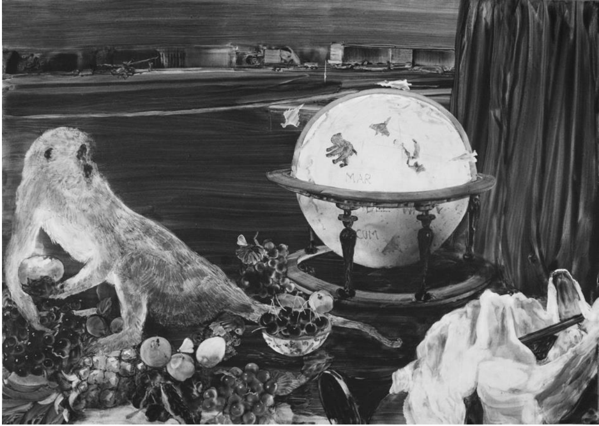
Sq.46 Global Reach 2019