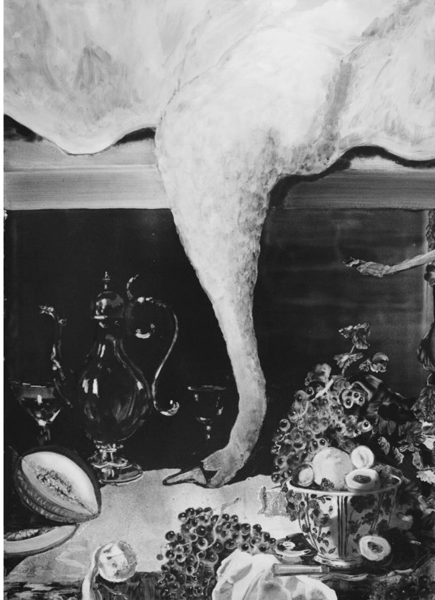
Sq.45 Turvy 2019