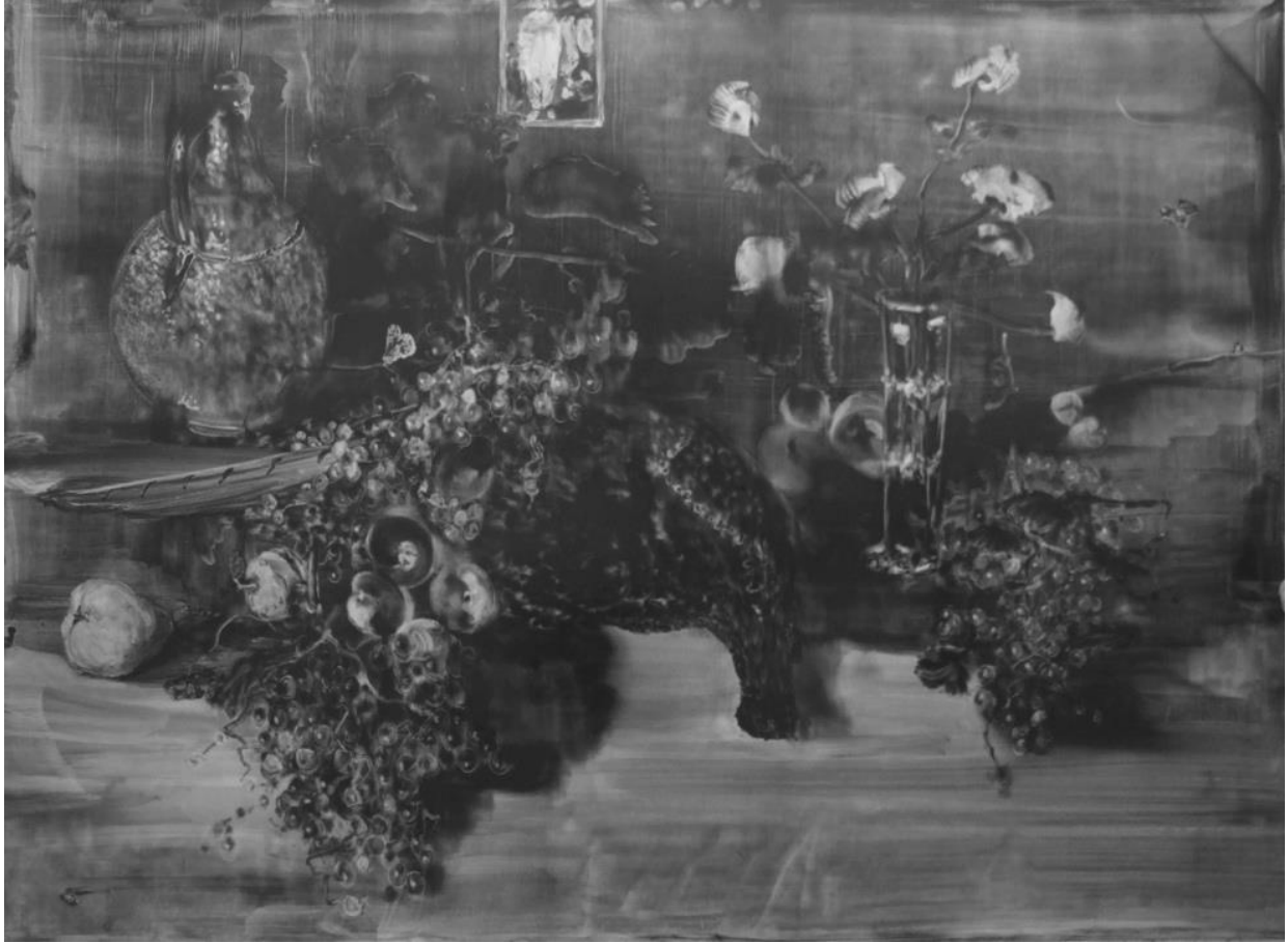
Sq.3 Still Life with Pheasant 2016