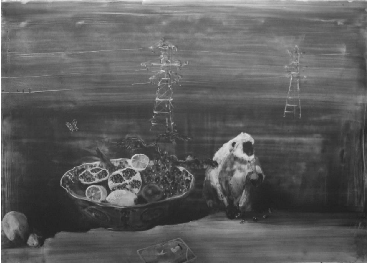
Sq.12 Forbidden Fruit 2016