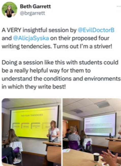
Figure 2. Tweet from Beth Garrett.

The session clearly resonated with members of the community, provoking interest and reflection, and perhaps invigorating relationships with writing.