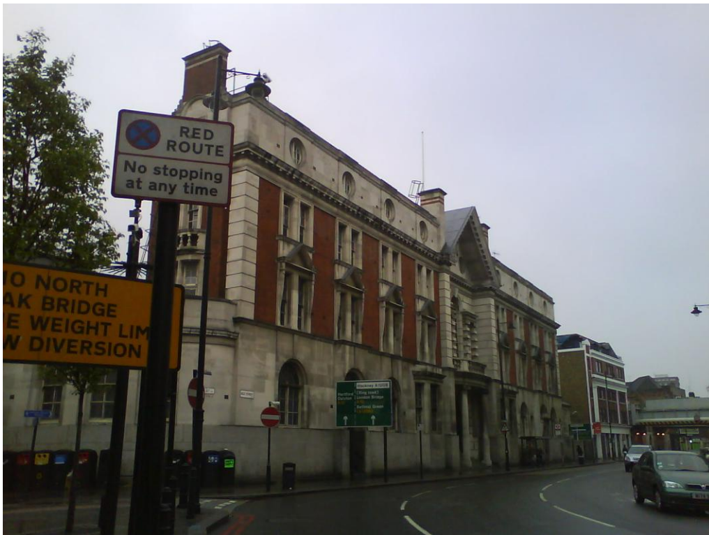
Photograph 1: the Old Street Police Court. April 2009

Children and young people were to make the journey up the stairs to the smaller, yet equally intimidating, second court room in order to have their cases heard. Section 111 of the Children Act required juvenile courts to be held, ideally, in a different building to the usual proceedings of the magistrates' court, or at least in a different room. If these were not possible, then the juvenile court should be held on different