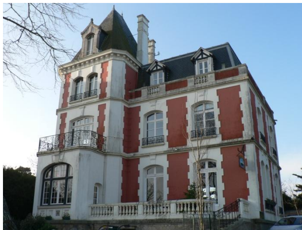
Image: Doenitz's forward headquarters at Kerneval near the Lorient submarine pens

The order has to be understood in terms of the context of the Laconia sinking, but also the wider culture and practice prevailing in the German submarine arm. Contrary to wartime British propaganda, German submariners did not routinely machine gun shipwrecked crews whose vessels had been destroyed. Indeed, the reality was quite the opposite. At the start of the war the German submarine arm had tried to abide by the spirit if not the letter of the 1936 London Submarine Protocol governing their operation in time of war. Under the protocol merchant ships were not to be sunk without warning and adequate provision made for their crews. Allowing crews to take to lifeboats and rafts was not considered adequate provision. In effect, observance of the London protocol took away the advantages of the submarine as a weapon of war. Despite this, in the early stages of the war German submariners did try to work within the spirit of the protocol.